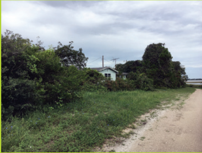
New property is the highest point in the area.

This is an exciting time for Magic Ridge. A deal has been reached, and the board has decided to purchase this property with funds that have accumulated over the years because of prudent management of TOS finances. Once this property is acquired, the Magic Ridge sanctuary will be expanded by over 40%, and an additional 80+ acres of