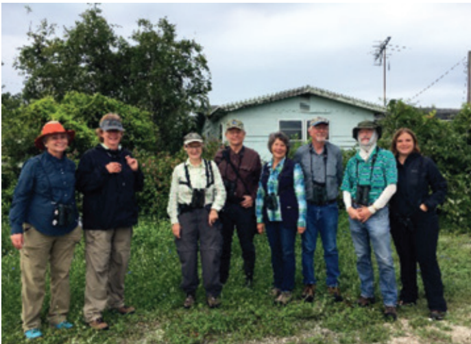
TOS Board members visiting our soon-to-be new property on Zimmerman Road.