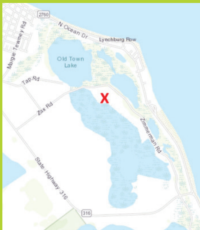
The red X marks the general area of the new property.