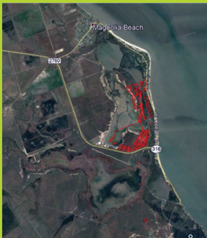
TOS Magic Ridge Bird Sanctuary (outlined in red)

NAME —Magic Ridge originated from one of the earlier birders in the area, Doris Wyman, pegging the name Magic Road because unusual birds would show up “like Magic” in the area. Maybe during one of your future visits to the sanctuary, “Magic” will happen for you.