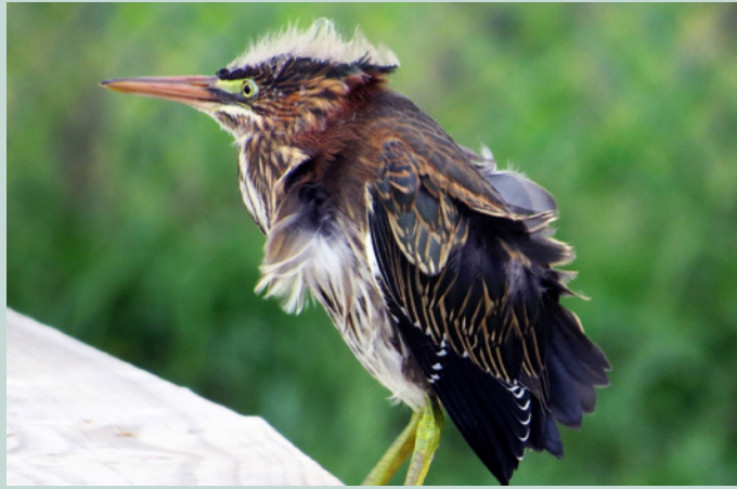
Spring migration turned into its usual enjoyment of baby birds all over the region, including these darling Green Herons at the SPI Birding Sanctuary.