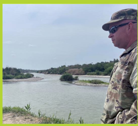
A National Guardsman is seen on Friday, May 28, 2021, patrolling the Rio Grande in Laredo, Texas, at an area where Zacate Creek empties into the river and where rare birds are found.