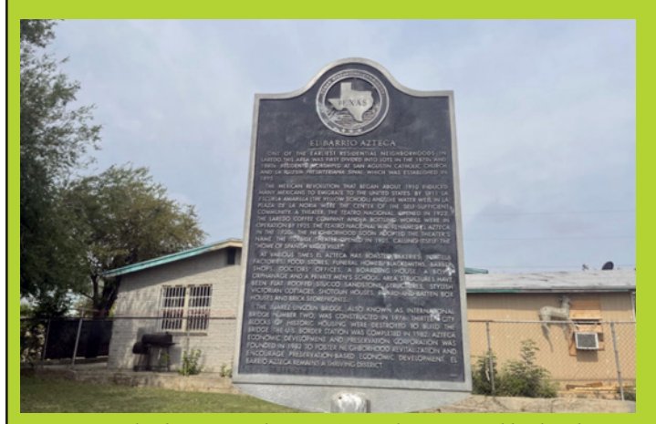
It's just past the downtown El Barrio Azteca historic neighborhood, which was build in the 1870s.

There is a stunning rock waterfall and a partial stone walkway already in place. It's an area where in the 1930s a developer had wanted to build a river walk that didn't happen and eventually the city of San Antonio built a successful riverwalk, instead.