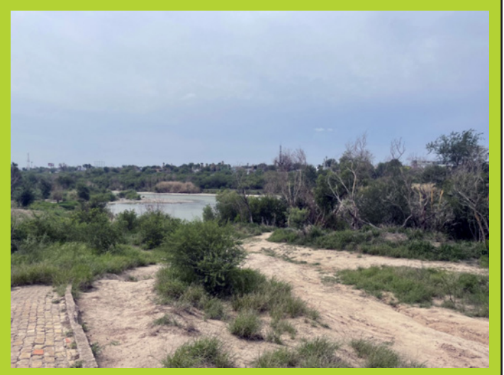
The stone Las Palmas Trail is seen leading to where Zacate Creek meets the Rio Grande in Laredo, Texas, an area now established as a natural landmark by the Laredo City Council. Across the river is the town of Nuevo Laredo, Mexico, as seen on Friday, May 28, 2021.

But the move might also help prevent border barrier and law enforcement construction from taking the border shorelands, environmentalists tell Border Report.