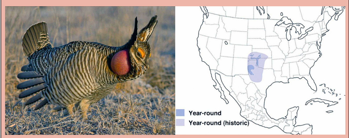
Lesser Prairie Chicken, Tympanuchus pallidicintus Photo and Map from Birds of the World https://birdsoftheworld.org/bow/species/lepchi/cur/introduction

On June 1, the U.S. Fish and Wildlife Service (FWS) published a Federal Register Notice proposing to list two distinct population segments (DPS) of lesser prairie-chickens under the Endangered Species Act. The Southern DPS consists of the shinnery oak ecoregion in New Mexico and Texas, and the Northern DPS consists of the sand sagebrush ecoregion, the mixed grass ecoregion, and the short grass/ Conservation Reserve Program (CRP) ecoregion in Texas, Oklahoma, Colorado, and Kansas; these regions make up the entirety of the range of lesser prairie-chickens. According to the FWS, habitat loss and fragmentation have caused declines of up to 90% from historic levels. As a result, the agency determined that the Southern DPS is warranted for listing as endangered and the Northern DPS is warranted for listing as threatened.