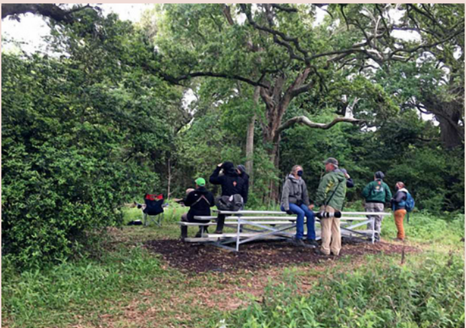
People using bleachers at Hooks Woods during spring migration.