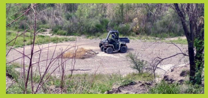
U.S. Border Patrol agents in ATV units are seen May 28, 2021, clearing brush for footprints of migrants in Laredo, Texas, in an area known as Riverbend, which has just been designated a natural landmark.