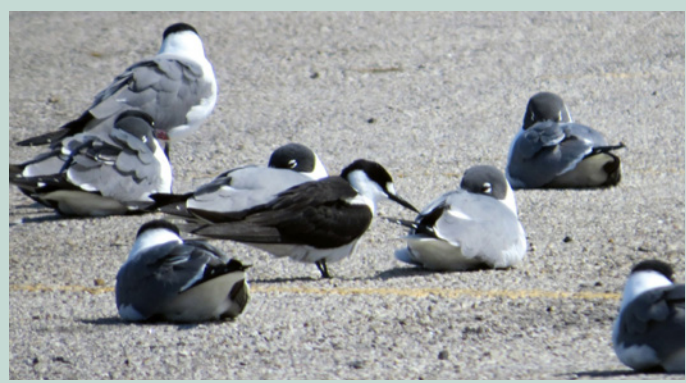
Finally, Rockport Beach Park hosted the Sooty Tern again this year. I spotted it in the parking lot on March 6th hanging around with Laughing Gulls. This sighting was earlier than usual.