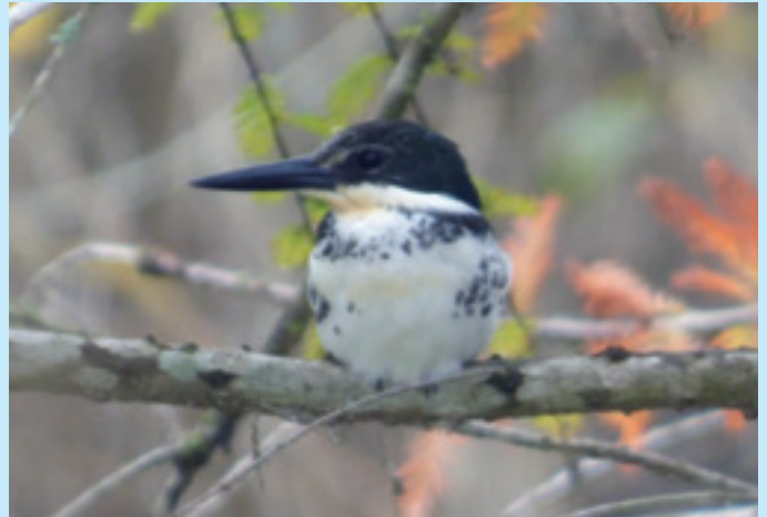
Green Kingfisher on Montezuma Cypress.

Hiking the grounds we discovered a mixed species feeding flock that included a Black-and-white Warbler. A Green Kingfisher patiently perched on a branch of a Montezuma Cypress for all to enjoy.