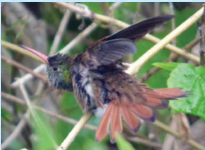
Buff-bellied Hummingbird https://www.youtube.com/watch?v=xdZXx3x34iA

It wasn't long after this that unexpected rain showers hit. The group took lunch under the covered observation deck and wondered around in leisure until it was time for the next stop. While enjoying the canopy shelter of a kind park volunteer's RV, Erin and I enjoyed watching a Buff-bellied Hummingbird bathe in the beads of rain stuck to the leaves and stems of a neighboring shrub. At Estero, we ended up seeing 69 species through the morning.