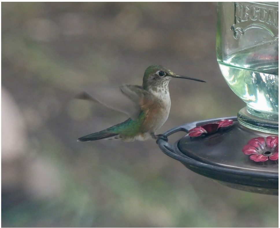
Broad-tailed Hummingbird © Charlie Plimpton 28 Sep 2019

Broad-tailed Hummingbird – A Broad-tailed Hummingbird visited Salado, Bell feeders 28 Sep–3 Oct (†ph. Charlie Plimpton, ph. Chelsea Plimpton). In the past decade, Broad-tailed appears almost annually at least once in Bell .