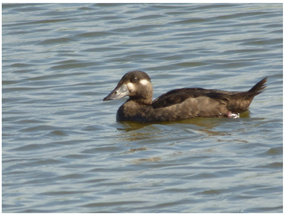
Surf Scoter © Candy McNamee 19 Oct 2019

White-winged Scoter – Only the third record for Bell , a White-winged Scoter was viewed at Stillhouse Hollow Lake from Stillhouse Park 3 Nov 2019 (†Gil Eckrich, ph. Daniel Kelch).