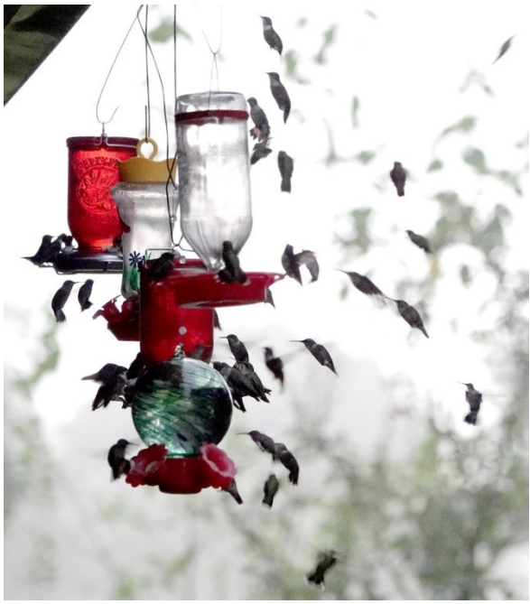
Ruby-throated Hummingbirds 27 Sep 2019

Ruby-throated Hummingbird – Ruby-throated Hummingbirds were in abundance 27 Sep in Kurten, Brazos when 41 were photographed in a single frame and at least 9 more were in nearby trees and bushes.