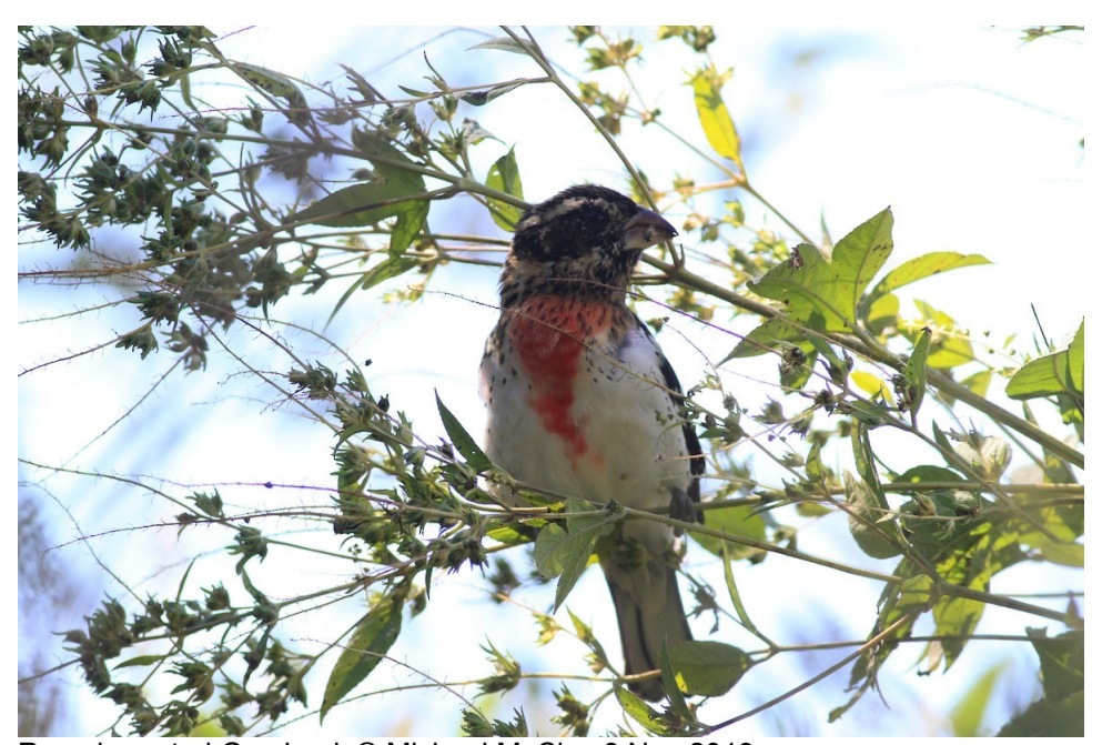
Rose-breasted Grosbeak