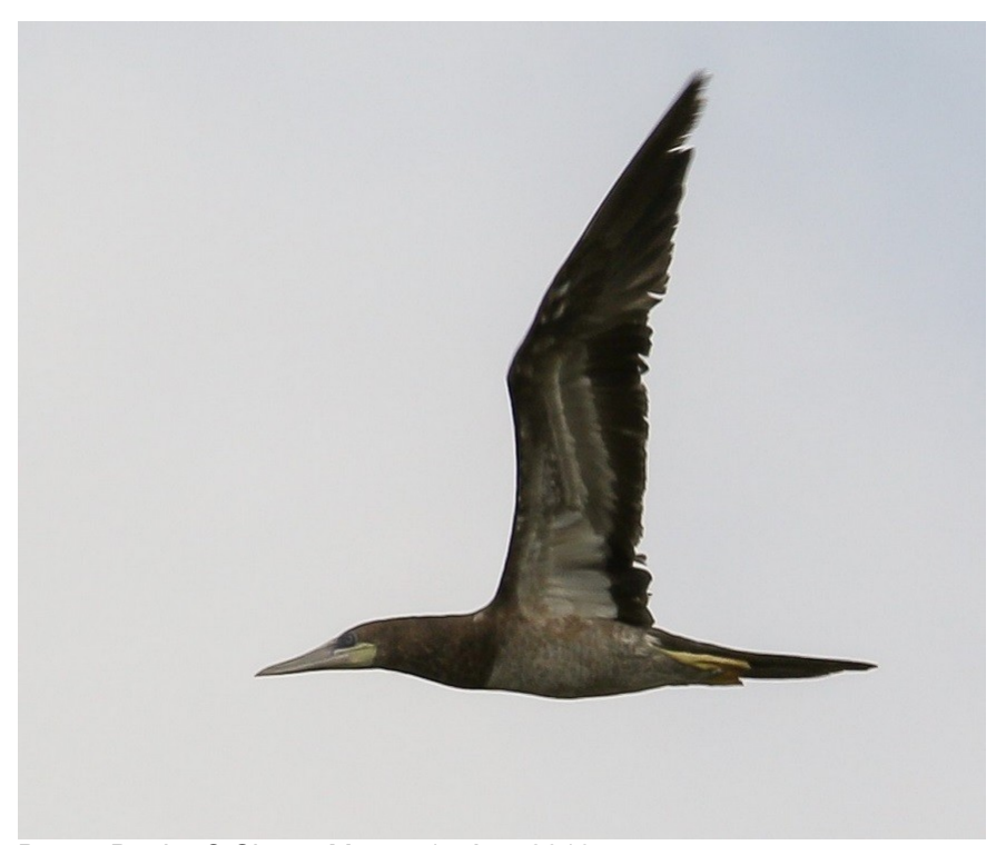
Brown Booby 17 Aug 2019