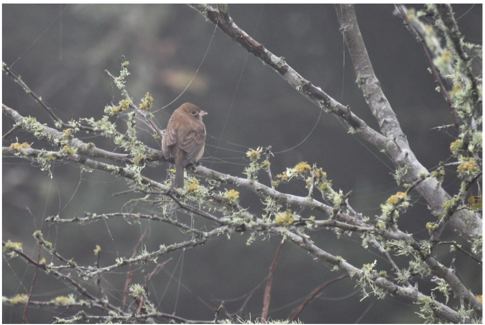
Indigo Bunting © John Hale 29 Nov 2019

Dickcissel – A late female Dickcissel was southeast of Bastrop, Bastrop 16 Nov (Jonah Gula).