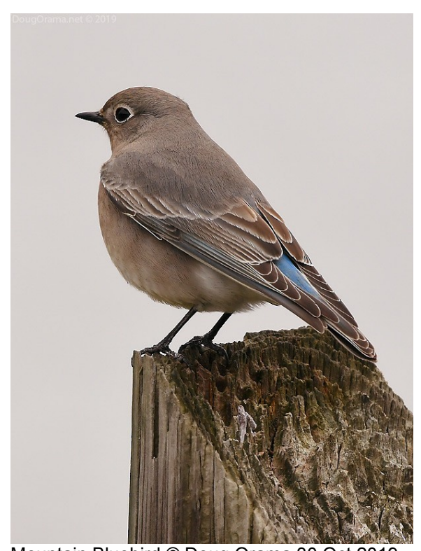
Mountain Bluebird 30 Oct 2019

Mountain Bluebird – A 6<sup>th</sup> record for Bell , a Mountain Bluebird was at Stillhouse Park, Stillhouse Hollow Lake 29-31 Oct (ph. Gil Eckrich, m.ob.).