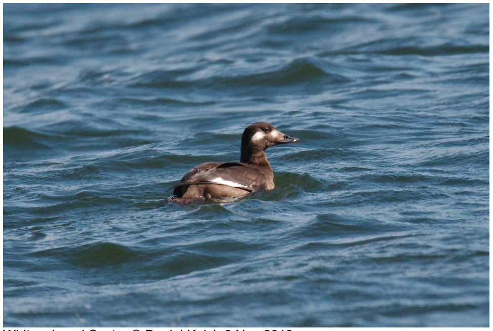
White-winged Scoter © Daniel Kelch 3 Nov 2019

White-winged Scoter – Only the third record for Bell , a White-winged Scoter was viewed at Stillhouse Hollow Lake from Stillhouse Park 3 Nov 2019 (†Gil Eckrich, ph. Daniel Kelch).