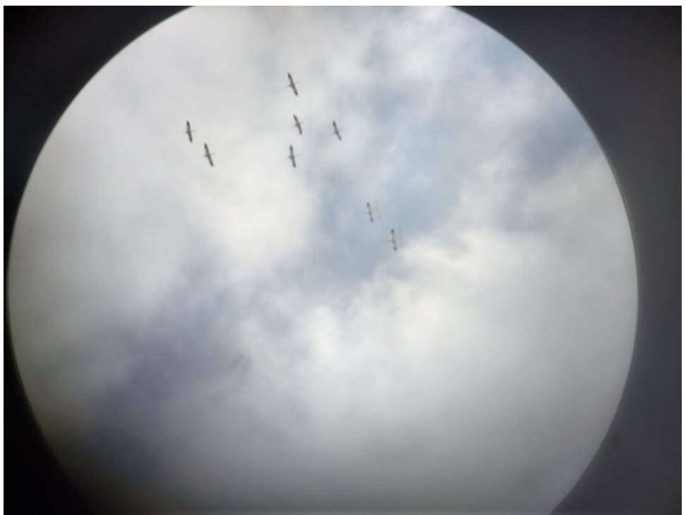
Whooping Crane © Timothy Freiday 1 Nov 2019

Whooping Crane – Two adult Whooping Cranes were photographed 27 Oct (ph. Tyler Miloy) at Sims Cutoff, Brazos . Another flock of 8 flew near Lexington, Lee 1 Nov (†ph. Timothy Freiday).