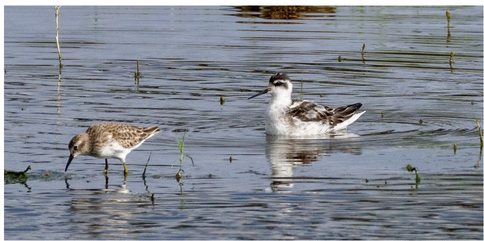
Red-necked Phalarope 28 Sep 2019