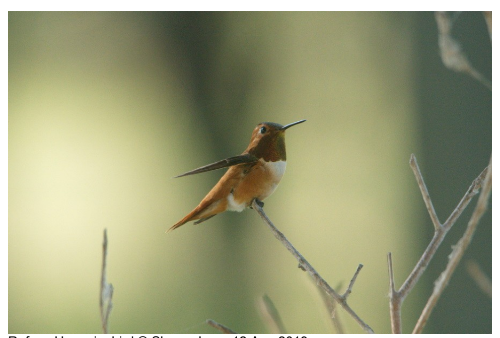
Rufous Hummingbird 12 Aug 2019

Rufous Hummingbird – A Rufous Hummingbird photographed near Blooming Grove 12 Aug is apparently only the third reported record for Navarro .