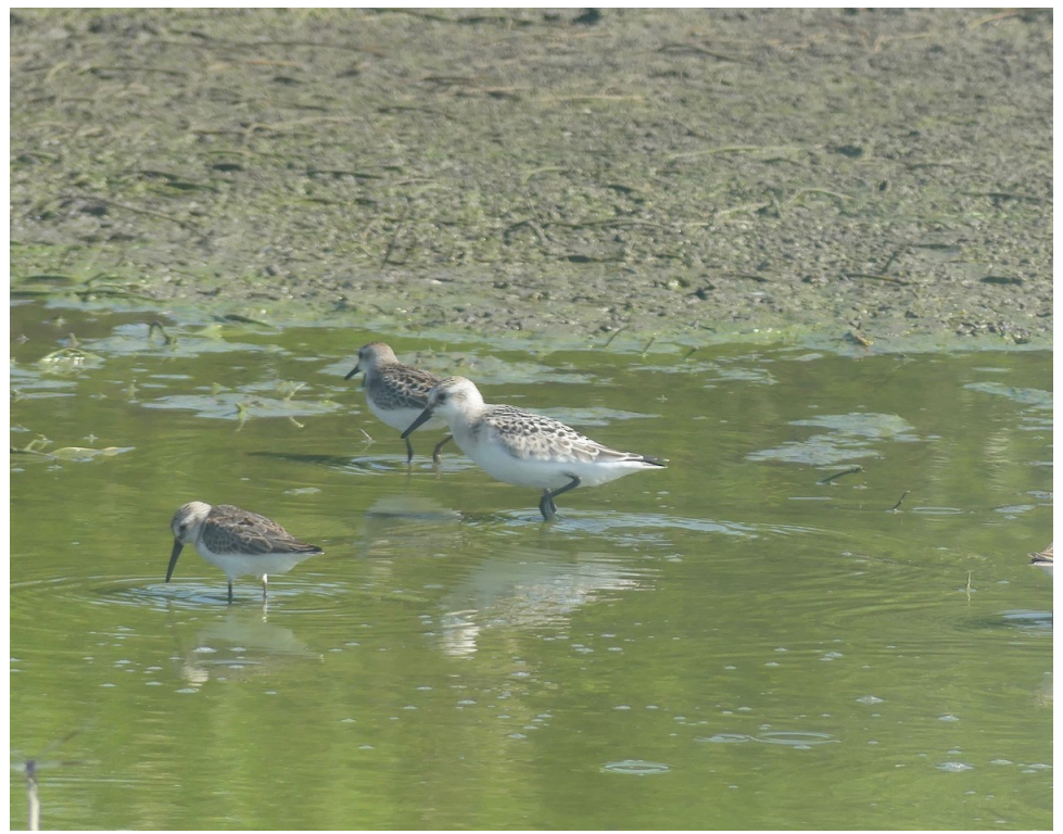
Sanderling 2 Sep 2019

Dunlin – A long staying single Dunlin was seen often 25 Oct–15 Nov (†Simon Kiacz, m. ob.) at Sims Lane, Brazos . Another was at Union Grove WMA, Stillhouse Hollow Lake, Bell 10 Nov (†Randy Pinkston).