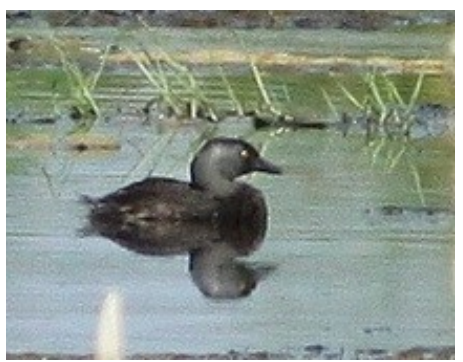
Least Grebe 1 Sep 2019