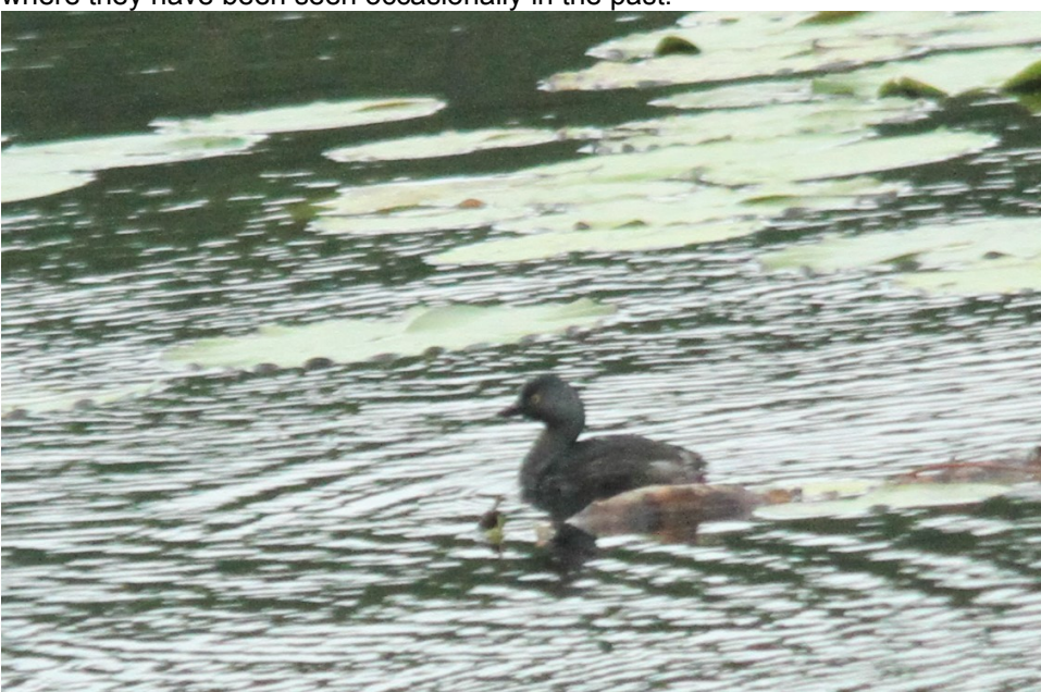
Least Grebe, 23 Apr 2019, Grimes County

Least Grebe – A single Least Grebe was photographed at Carlos Lake, Grimes 23 Apr where they have been seen occasionally in the past.