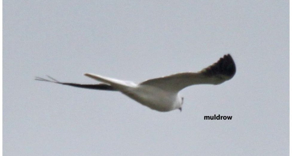
White-tailed Kite, 26 Mar 2019, McLennan County