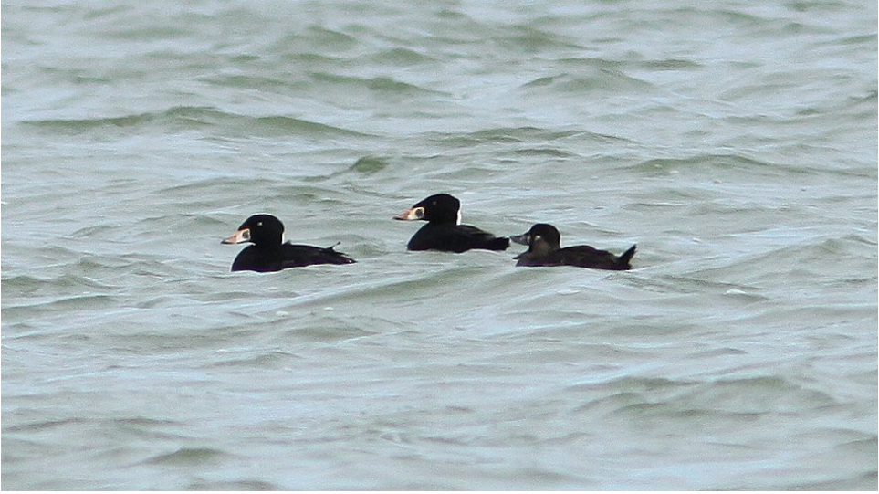
Surf Scoter, 16 Mar 2019, Bell County