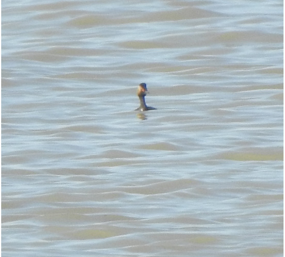
Eared Grebe, 12 May 2019, Brazos County