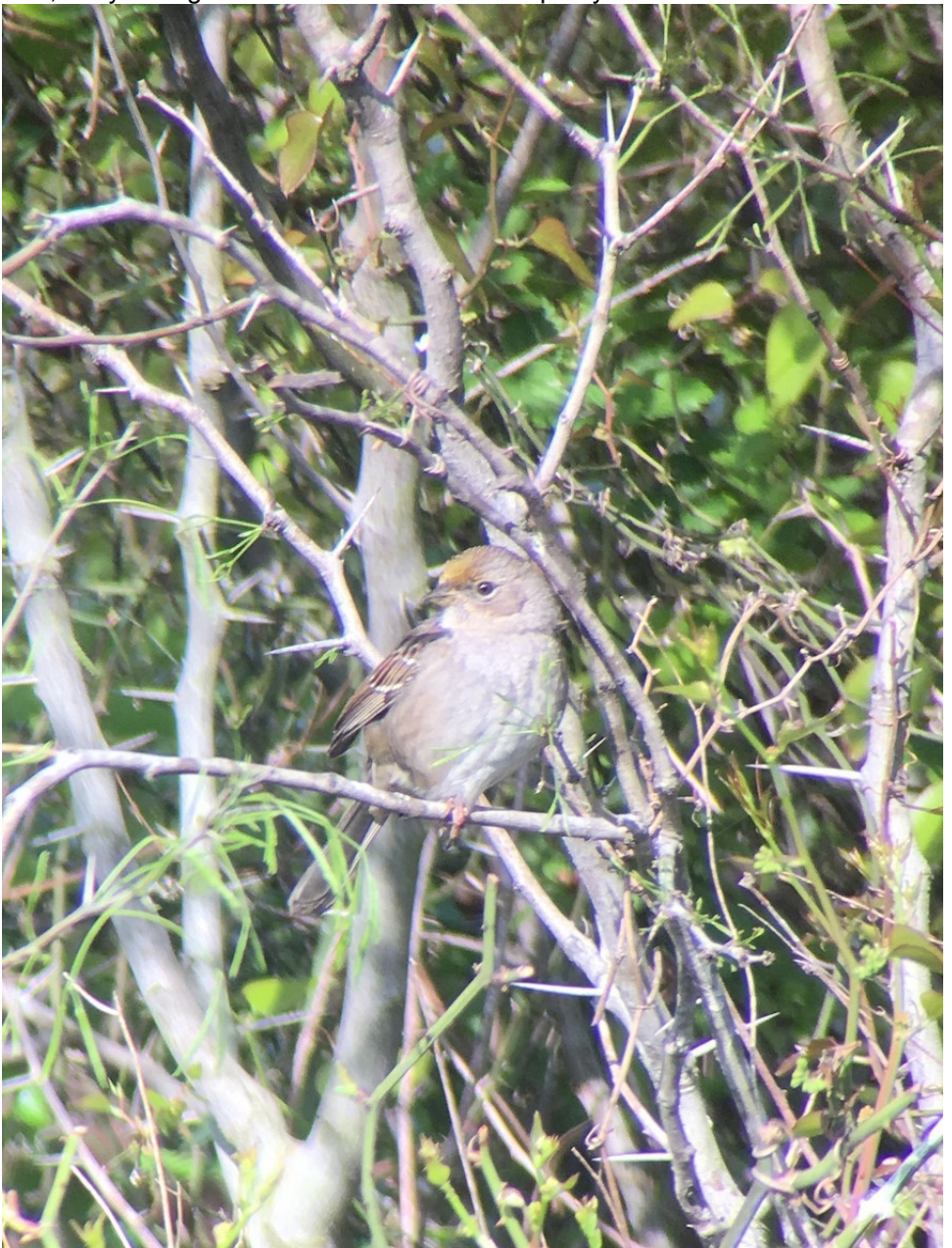
Golden-crowned Sparrow, © Colton Robbins, 27 Mar 2019, Bastrop County

hit it, the yellow/gold in the forehead stood out pretty well."