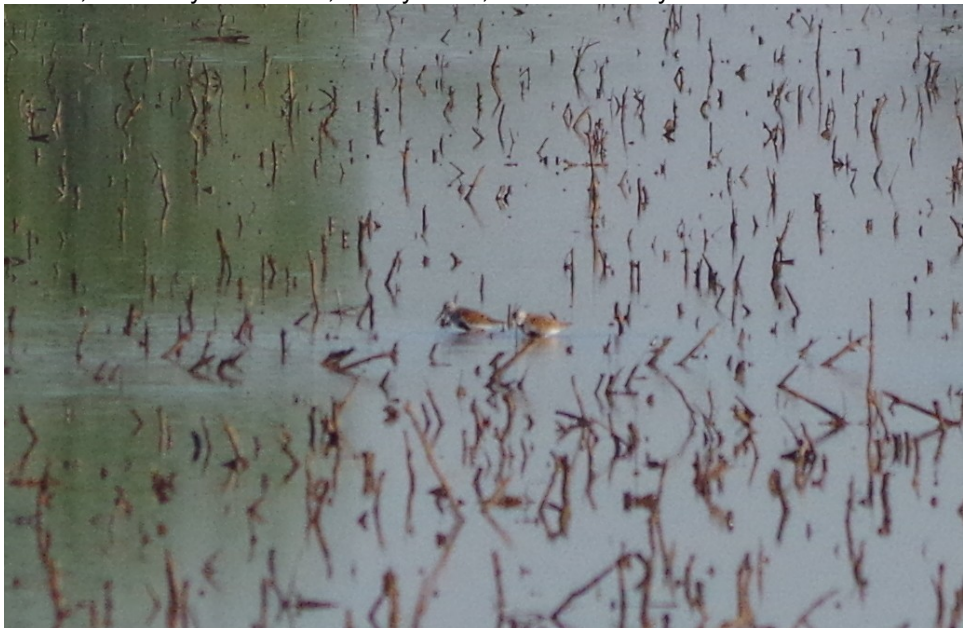
Dunlin, 13 May 2019, Robertson County

Dunlin, 4 May 2019, Brazos County