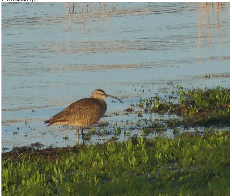
Whimbrel, 4 May 2019, Bell County