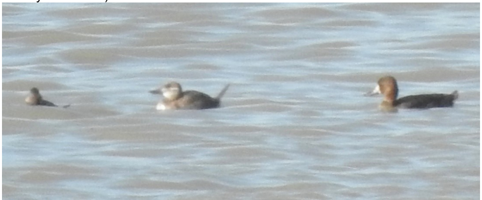
Ruddy Duck, 12 May 2019, Brazos County