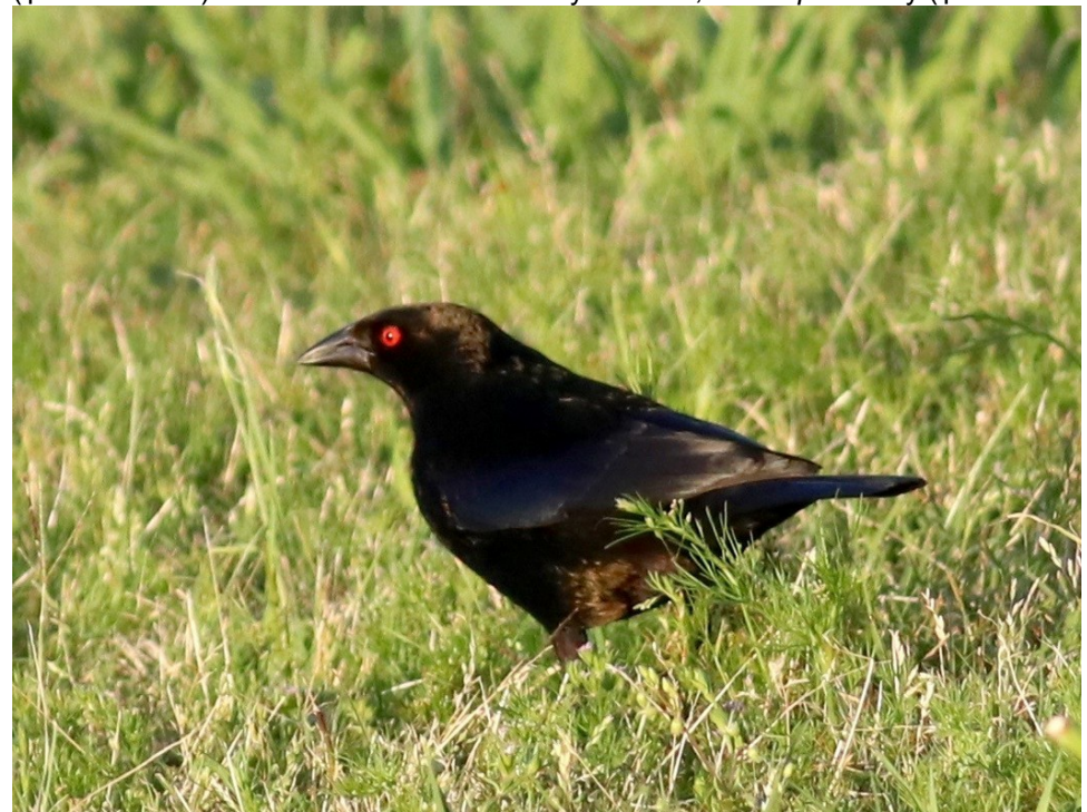
Bronzed Cowbird, 21 Apr 2019, Brazos County