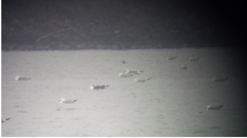
Lesser Black-backed Gull, © Greg Cook, 2 Mar 2019, Navarro County

Lesser Black-backed Gull – A distant digiscoped Lesser Black-backed Gull at Lake Halbert 2 Mar (ph. Greg Cook) was a first county record for Navarro .