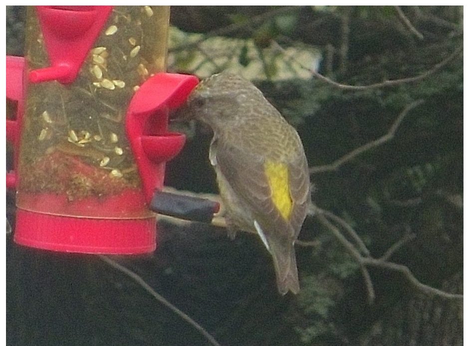
Red Crossbill, © Harper Price, 4 Apr 2019, Bell County