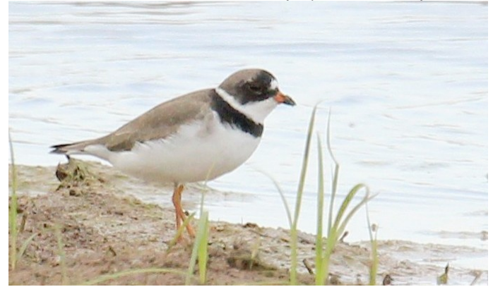
Semipalmated Plover, © Shirley Wilkerson, 12 Apr 2019, Brazos County

Semipalmated Plover – An occasional species to Brazos , up to four Semipalmated Plovers were in a flooded field at Sims Lane 7-22 Apr (†John Hale, ph. Shirley Wilkerson, et al.).