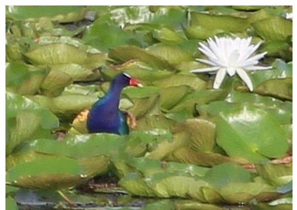
© Greg Page, 22 Jun 2019, Grimes County

Common Gallinule – Two adults with 3 chicks were noted at Carlos Lake, Grimes 9 Jun (Darrell Vollert).