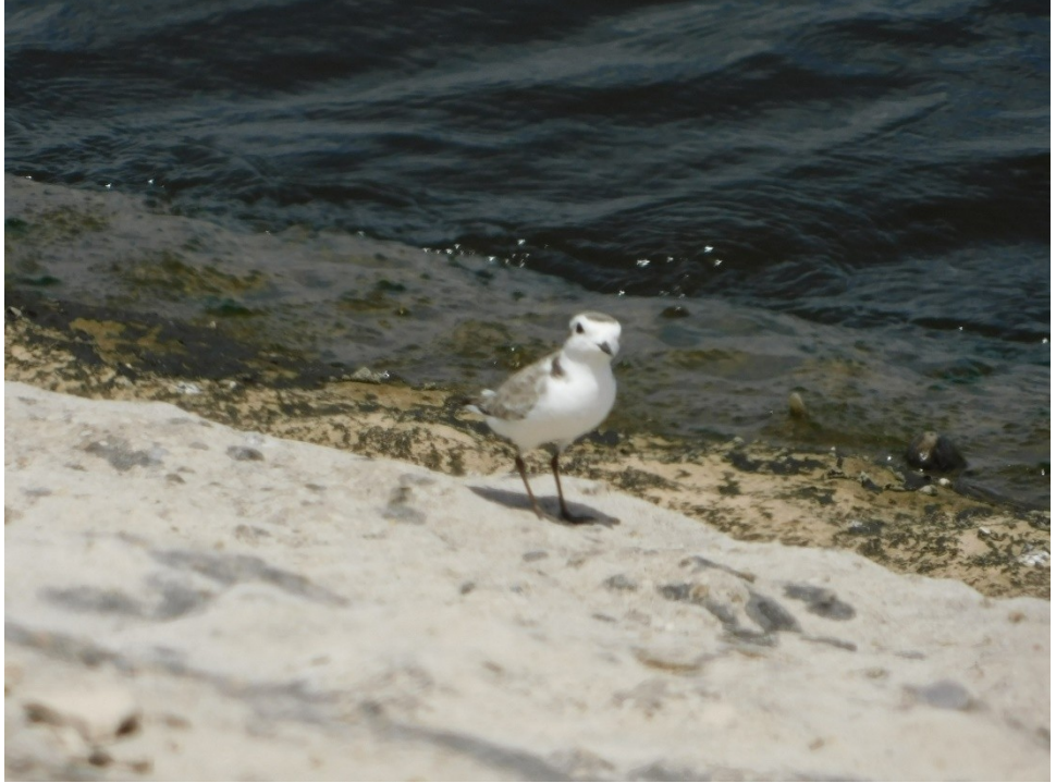
28 Jul 2019, Grimes County