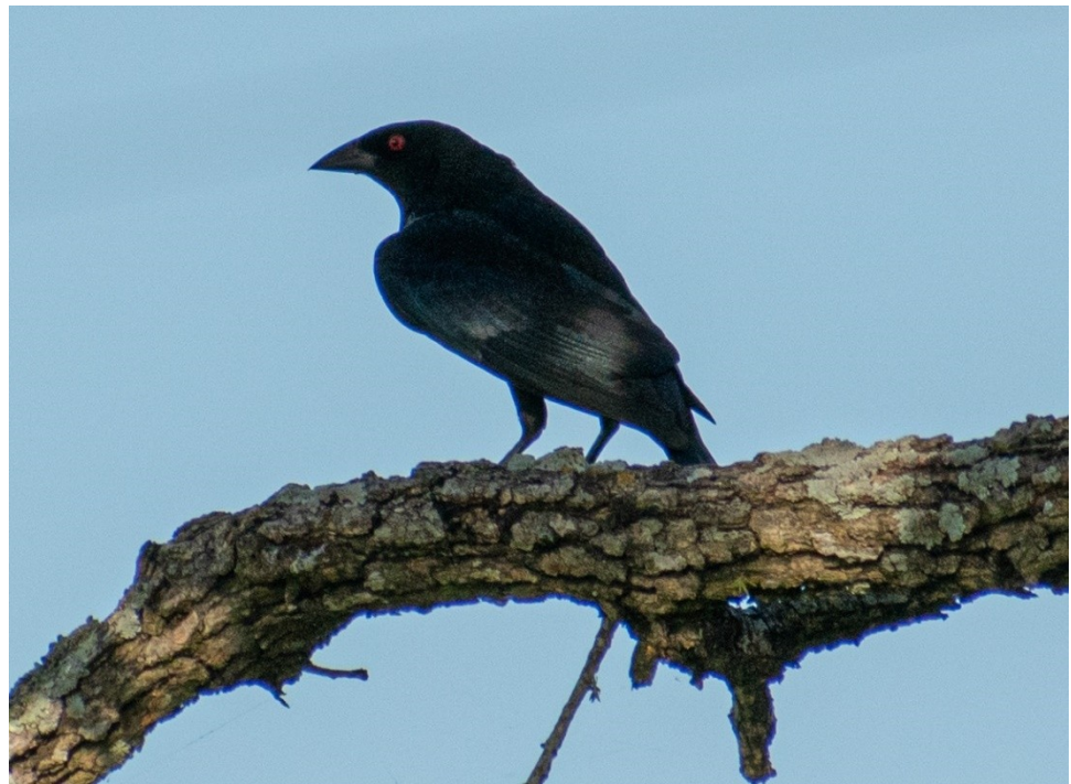
17 Jun 2019 Brazos County