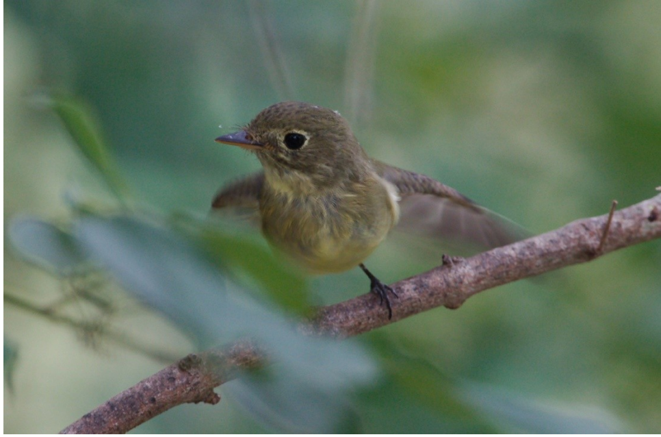
11 Jun 2019 Bell County