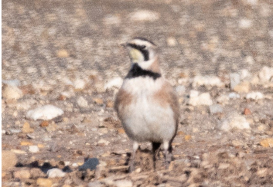
6 Jun 2019, McLennan County

Cedar Waxwing – An out-of-season Cedar Waxwing at Belton 21 Jun (ph. Gil Eckrich) provided the only summer record for Bell .