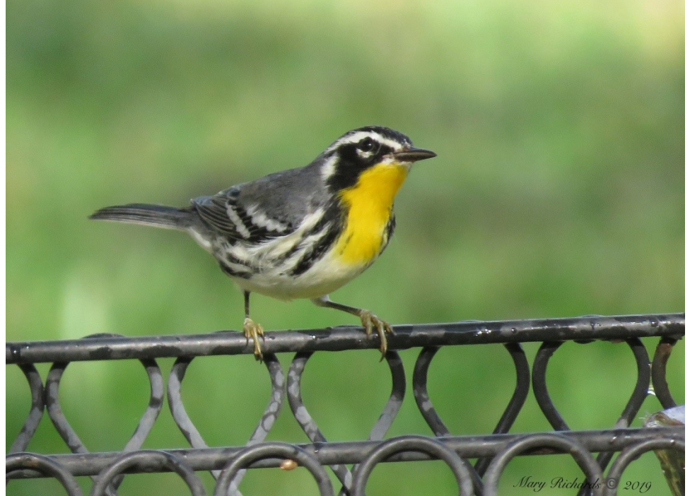
30 Jul 2019, Brazos County

Yellow-throated Warbler – An early migrant for Brazos and only the third summer record was a Yellowthroated Warbler at Red Feather Nature Preserve, Kurten 30 Jul (ph. Mary Richards).