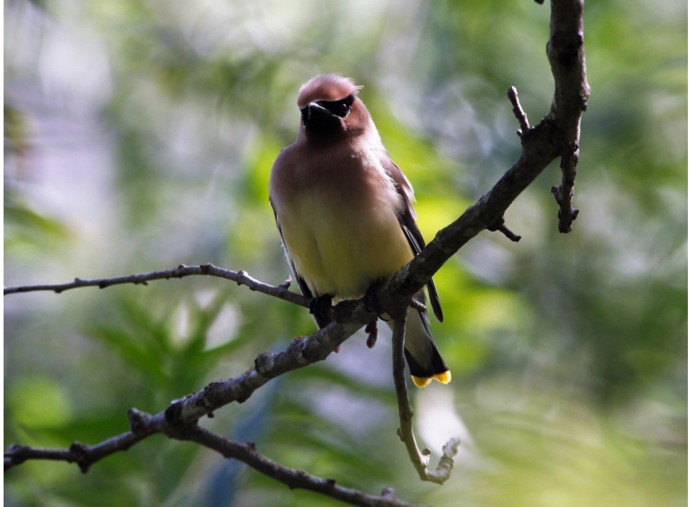
21 Jun 2019, Bell County

Cedar Waxwing – An out-of-season Cedar Waxwing at Belton 21 Jun provided the only summer record for Bell.