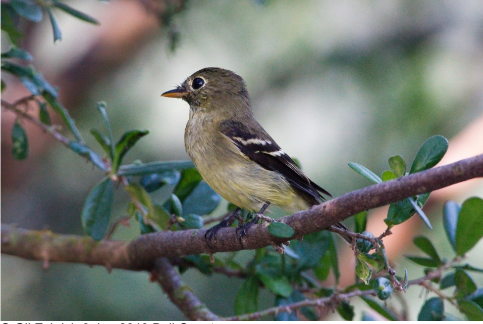
3 Jun 2019 Bell County