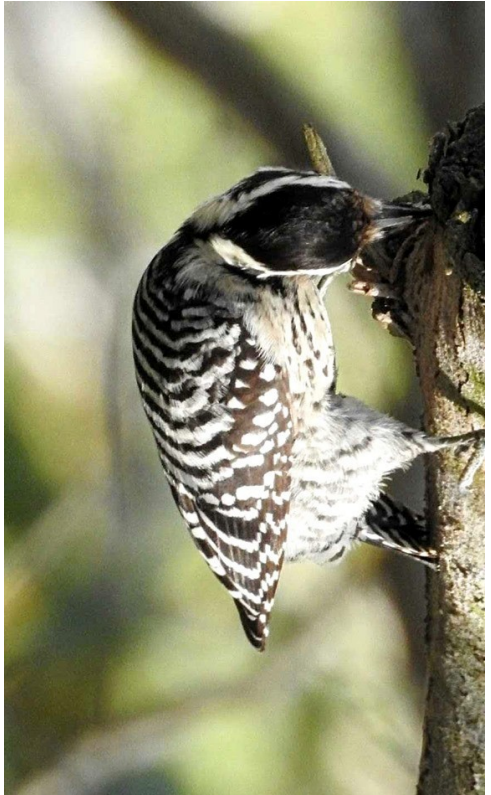
© Smily Flores 16 Jun 2019 Brazos County

Ladder-backed Woodpecker – Although not unusual in the 1960s, 70s, and 80s, there had been only 2 records since than for Brazos ; now a third record is 16 Jun (ph. Smily Flores) at a home in College Station.