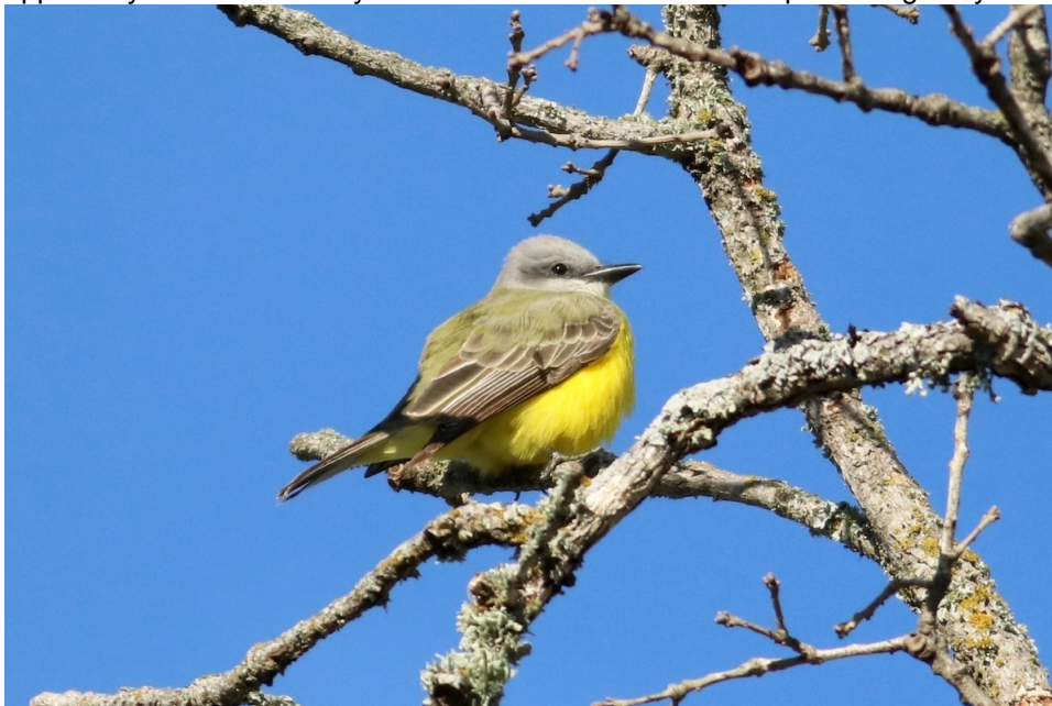
Couch's Kingbird, Finfeather Lake

Couch's Kingbird – Couch's Kingbird did not reach northward to Brazos until 2004 when it appeared at Country Club Lake. It was reported there again in 2005, but not thereafter until this fall. Then it apparently moved to nearby Finfeather Lake where it was reported regularly 13 Nov–15 Feb (m.ob.).