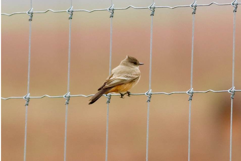
Say's Phoebe, Brazos County