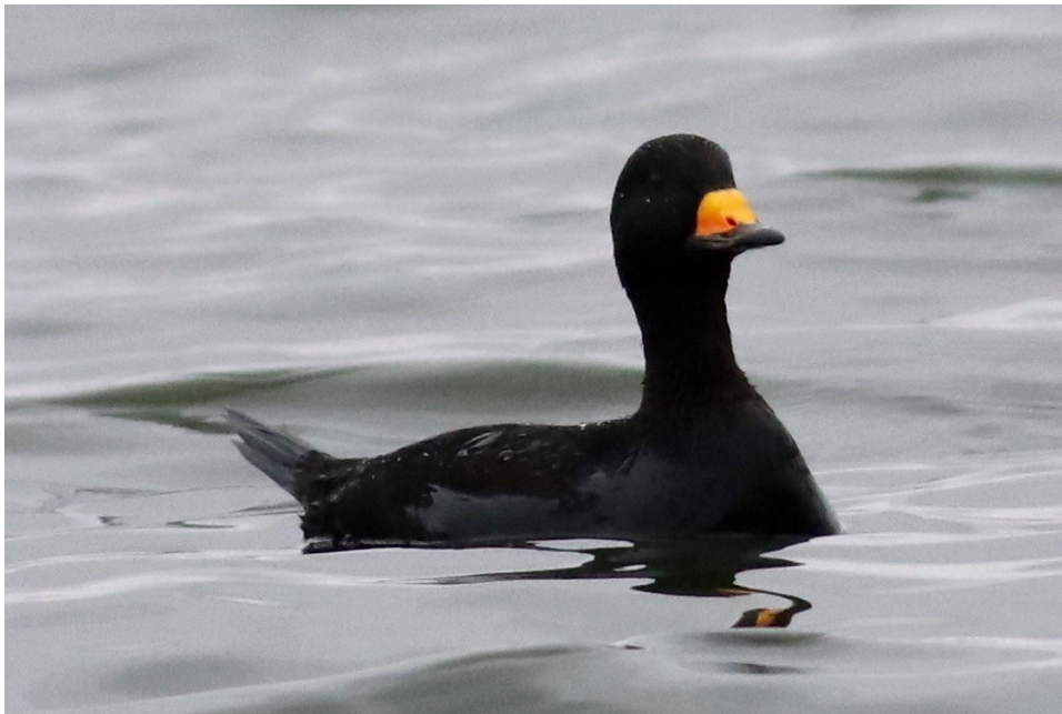
Black Scoter, Fairfield Lake S.P.