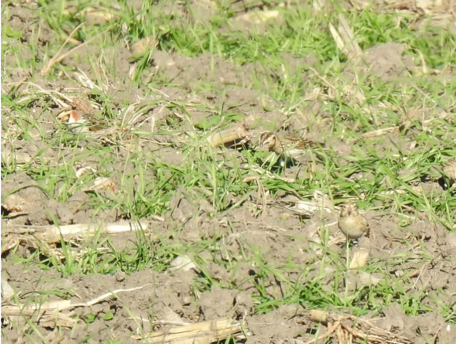
Lapland Longspurs, Milam County

Longspur sp. – In Milam , where longspur sp. are rarely reported, a mixed flock included at least 2 Chestnut-collared Longspurs, 35 Lapland Longspurs, and 4 McCown's Longspurs in a plowed field near Clarkson 23 Dec (ph. † Karen Pair).