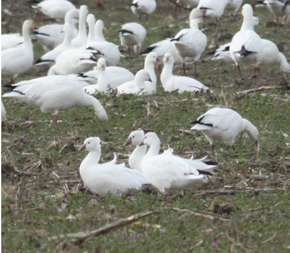
Ross's Geese, Bell County