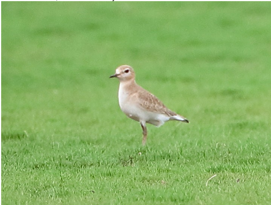
Mountain Plover, Burleson County © Mike Jones

Ruddy Turnstone – Certainly the strangest and most inexplicable sighting of the season is 6 Ruddy Turnstones found in a wooded area of College Station, Brazos 16 Feb (ph. Susan Miles). Unique for number, date, habitat, mild weather conditions, and far-inland location, were it not for a good photo it is unlikely it would have been believed possible.