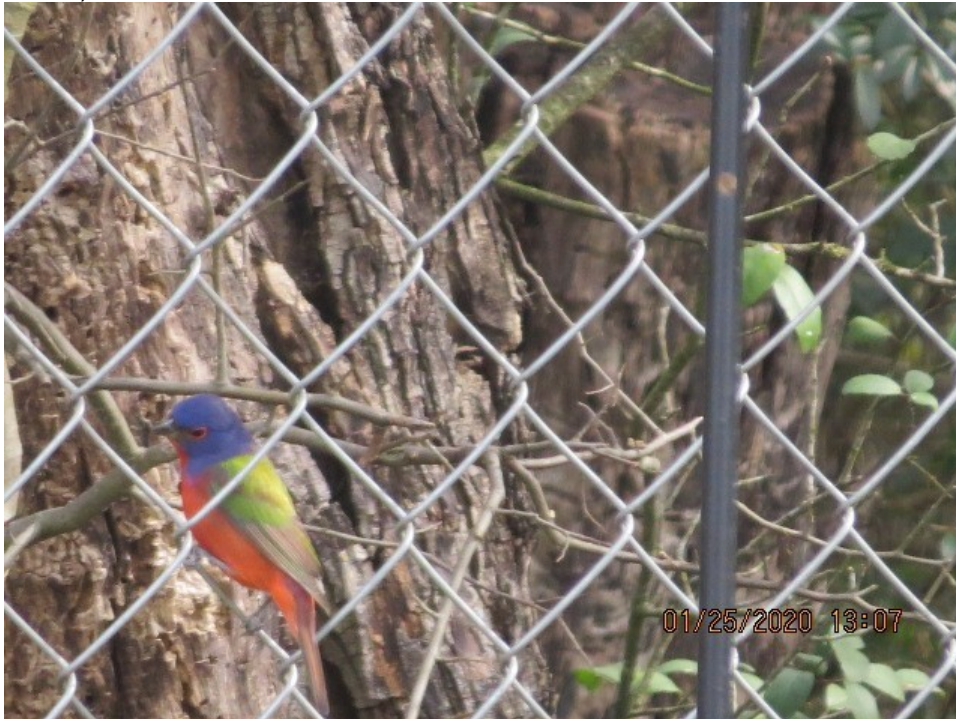
Painted Bunting, Bryan, Brazos County

Painted Bunting – Rare in winter in the Central Brazos Valley, single adult male Painted Buntings were seen at Bryan, Brazos 25 Jan (ph. Sandy Dillard) and at Chappell Hill, Washington 20-23 Feb (ph. Darrell Vollert).