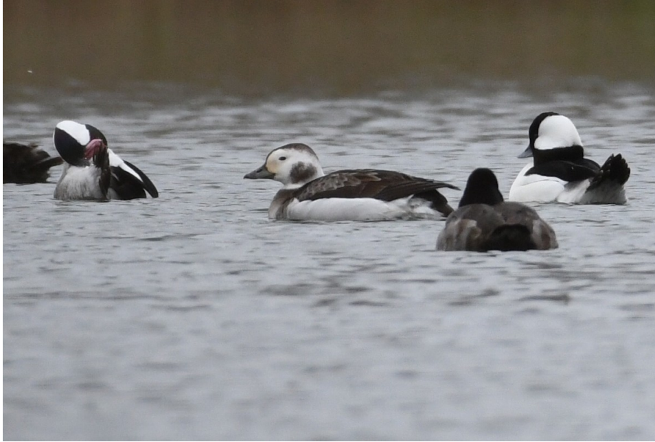
Long-tailed Duck, McLennan County