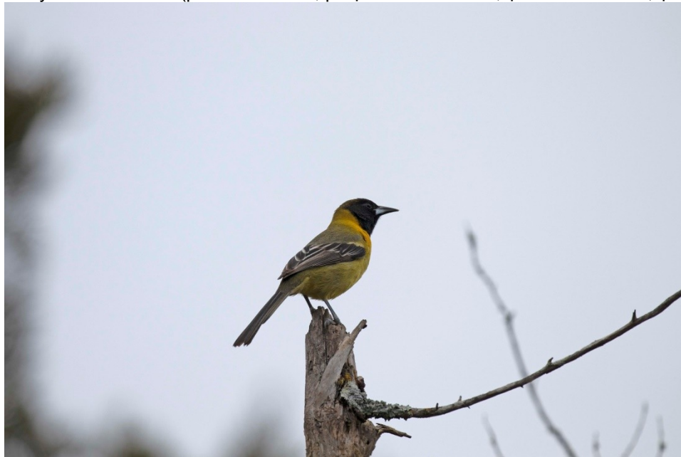
Audubon's Oriole, Bastrop County