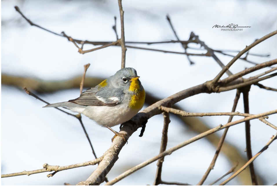
Northern Parula, Fayette County