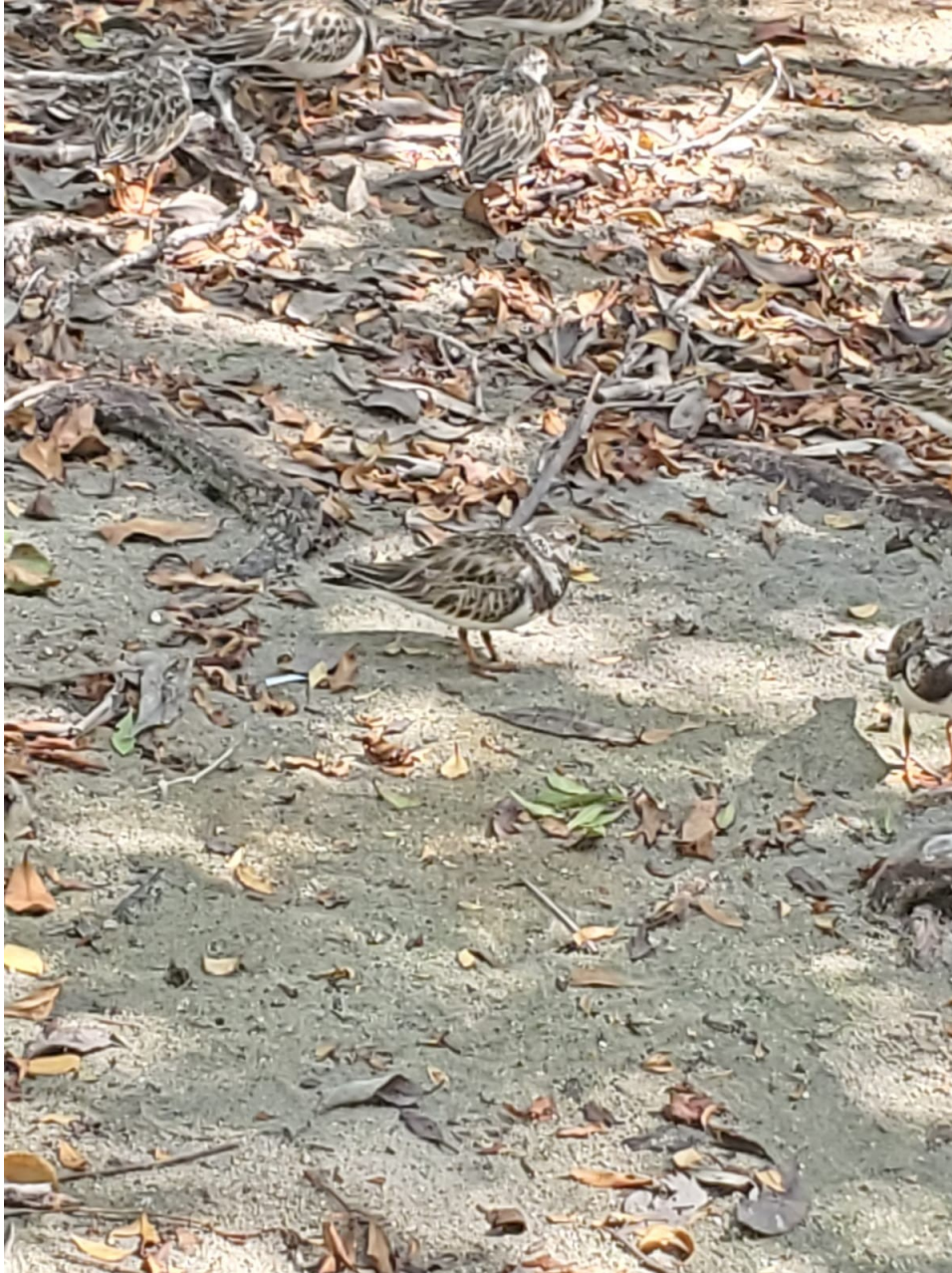
Ruddy Turnstones, Brazos County