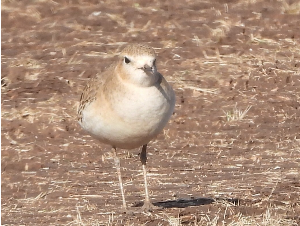
Mountain Plover, Burleson County