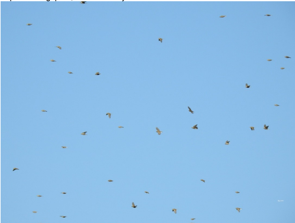
McCown's Longspurs, Milam County