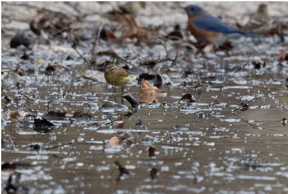
Palm Warbler, McLennan County