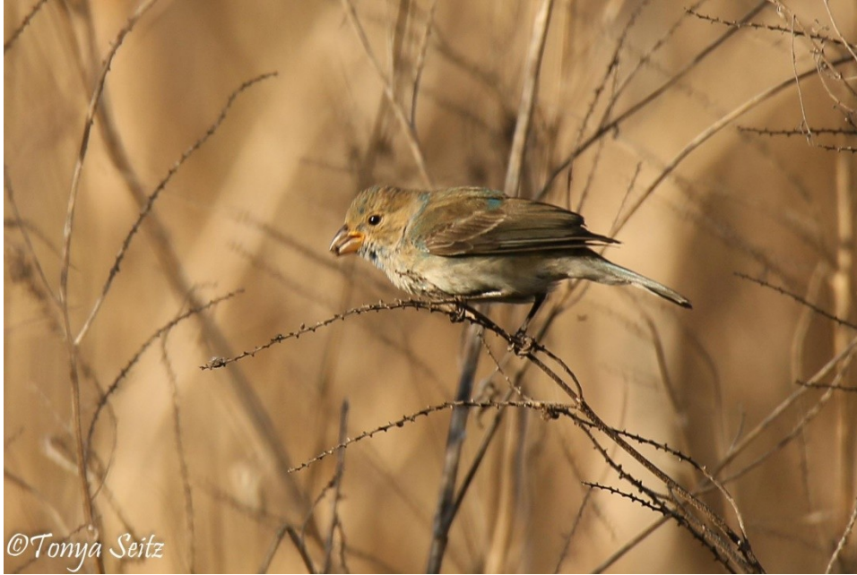
Indigo Bunting, Washington-on-the-Brazos S.P.

Painted Bunting – Rare in winter in the Central Brazos Valley, single adult male Painted Buntings were seen at Bryan, Brazos 25 Jan and at Chappell Hill, Washington 20-23 Feb.