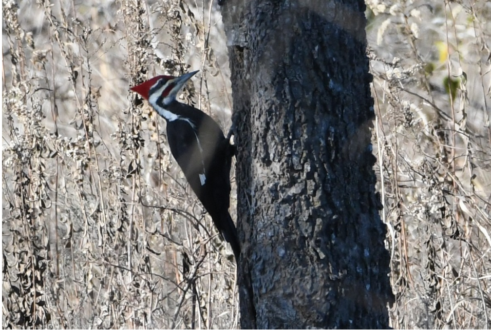
Pileated Woodpecker, Lake Waco

Crested Caracara – An unusually large gathering of 56 Crested Caracaras 25 Dec (Dennis Palafox) were in the Utley area, Bastrop .