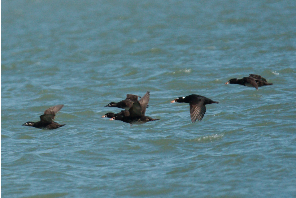
Surf Scoter, Belton Lake