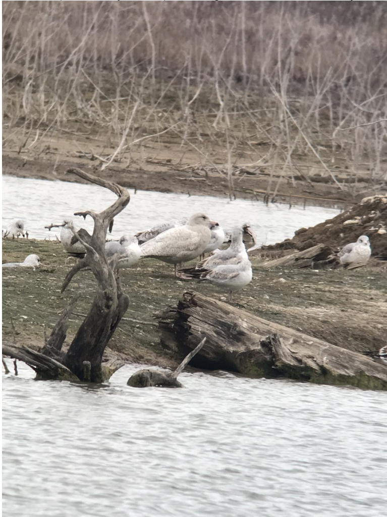
Glaucous Gull, Slough Pond