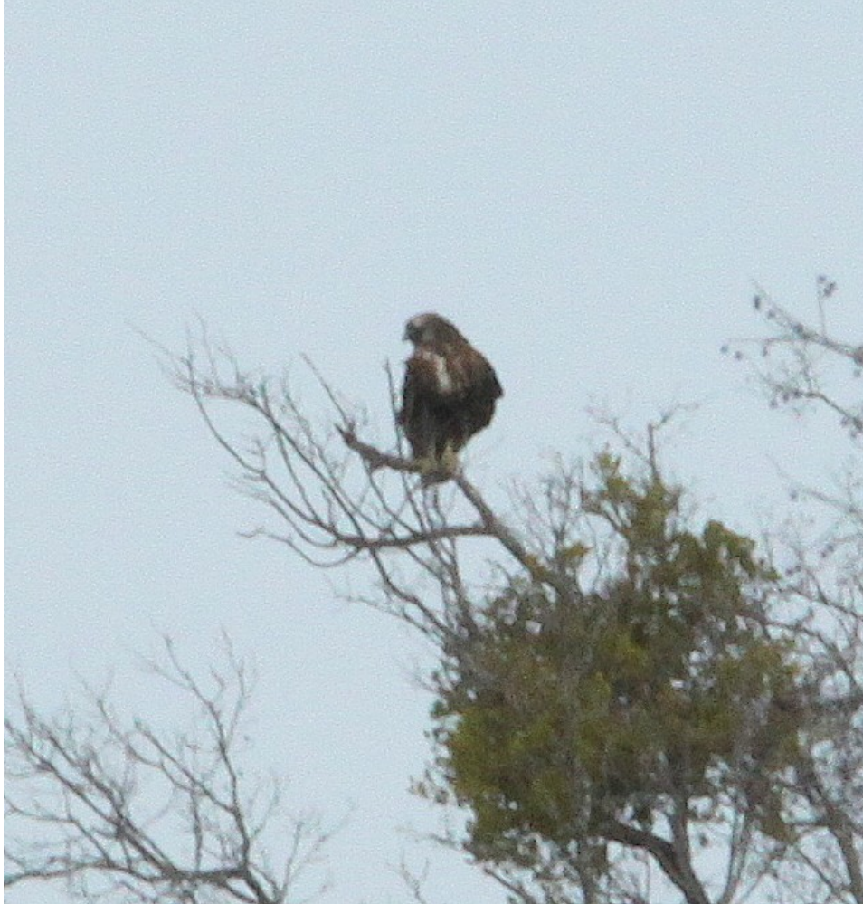
White-tailed Hawk, Bell County