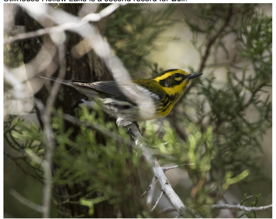
Townsend's Warbler 12 Oct 2020, Stillhouse Hollow Lake, Bell Co.

Townsend's Warbler – A Townsend's Warbler 12 Oct at Gravel Crossing W.M.A., Stillhouse Hollow Lake is a second record for Bell.