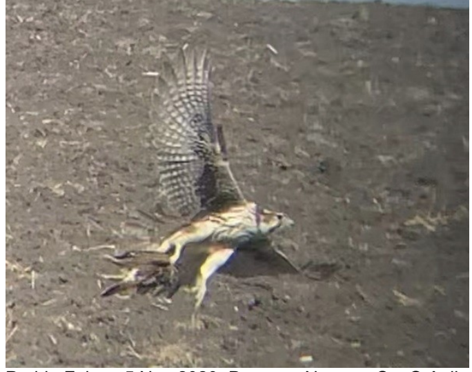
Prairie Falcon 5 Nov 2020, Dawson, Navarro Co. © Auliya Gurzenda

Prairie Falcon – A fourth record for Navarro (the first was in 1879), a Prairie Falcon was eating a songbird in an open field near Dawson 5 Nov (ph. Auliya Gurzenda).