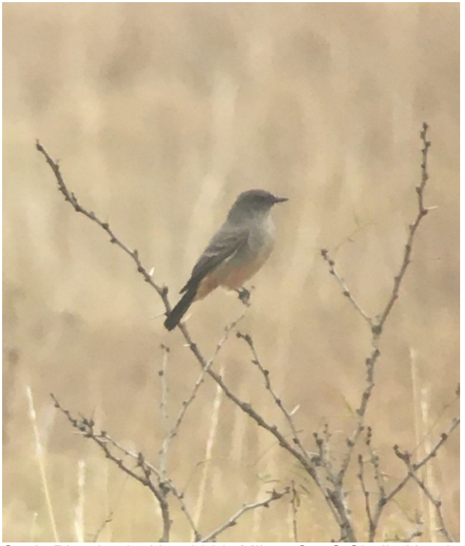
Say's Phoebe 27 Nov 2020, Milam Co.