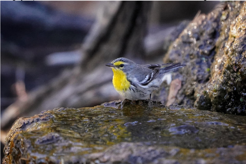
Grace's Warbler 4 Nov 2020, Bastrop Co. © Brian Burgoyne

Grace's Warbler – A Grace's Warbler was photographed at a private residence in Bastrop 4 Nov (Brian Burgoyne). It is the second Austin-area record, the first being 28 Oct 1979 in Austin.