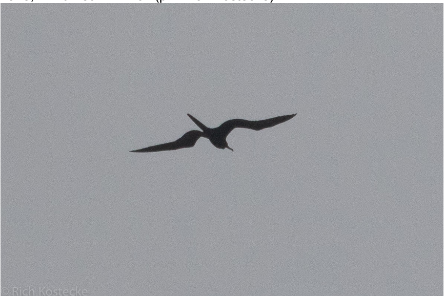
Magnificent Frigatebird 24 Nov 2020, Granger Lake, Williamson Co.