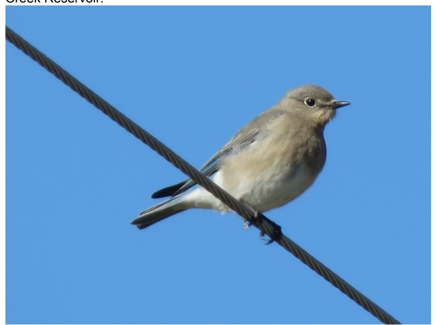
Mountain Bluebird 30 Nov 2020, Kemp Road, Brazos Co. © Mary Richards

Mountain Bluebird – Mountain Bluebirds were last seen in Brazos in 1963, and now 28 Nov+ (ph. John Hale, m.ob.) one was observed near the Brazos River at Kemp Road. Up to 20 Mountain Bluebirds were in McLennan 8 Nov+ (ph. John Muldrow, m.ob.), found mostly at Old Crawford Road and Trading House Creek Reservoir.