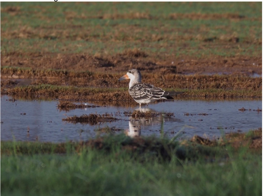
Black Skimmer 2 Aug 2020 Sims Lane, Brazos Co.