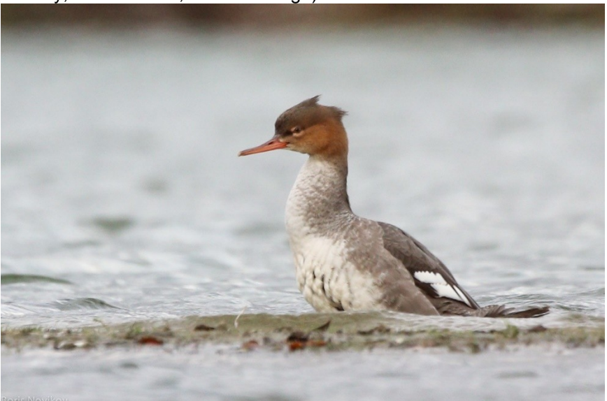
Red-breasted Merganser, 29 Nov 2020 Finfeather Lake, Brazos Co.

Black-billed Cuckoo – Extremely rare in fall, a juvenile Black-billed Cuckoo was photographed in College Station, Brazos 25 Sep.