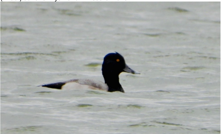
Greater Scaup, 29 Nov 2020, Finfeather Lake, Brazos Co.

(m.ob.) at Lake Bryan and Finfeather Lake.