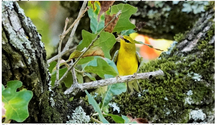
Blue-winged Warbler 20 Aug 2020, Kurten, Brazos Co. © Shirley Wilkerson

Blue-winged Warbler – Rare in fall, especially in the past decade, a Blue-winged Warbler was photographed at Kurten, Brazos at the very early date of 20 Aug (ph. Shirley Wilkerson).