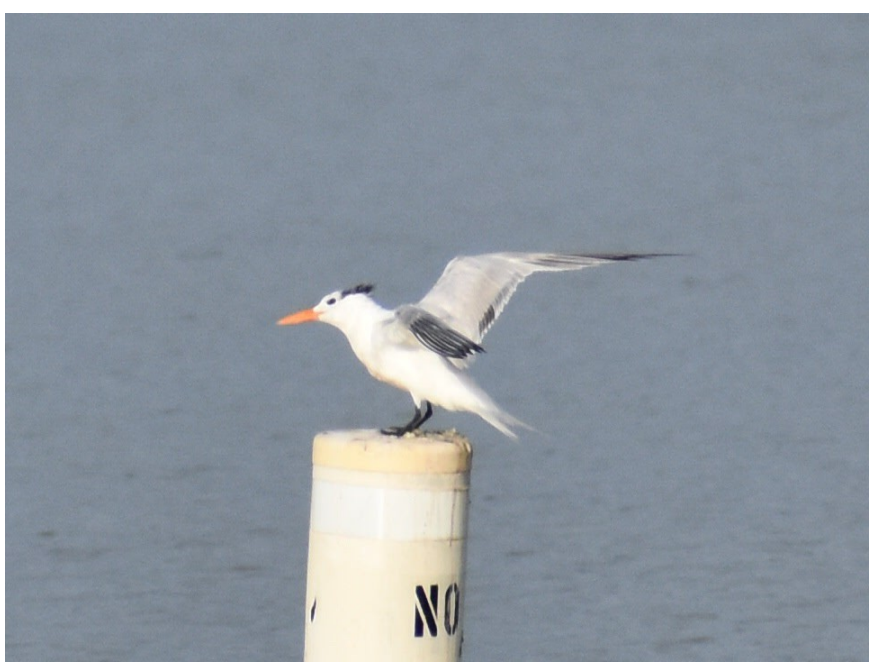
Royal Tern 30 Aug 2020, Lake Bryan, Brazos Co.