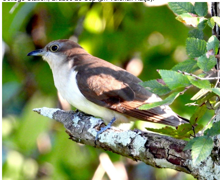
Black-billed Cuckoo, 25 Sep 2020, College Station, Brazos Co. © Vaishali Katju

Black-billed Cuckoo – Extremely rare in fall, a juvenile Black-billed Cuckoo was photographed in College Station, Brazos 25 Sep (ph Vaishali Katju).