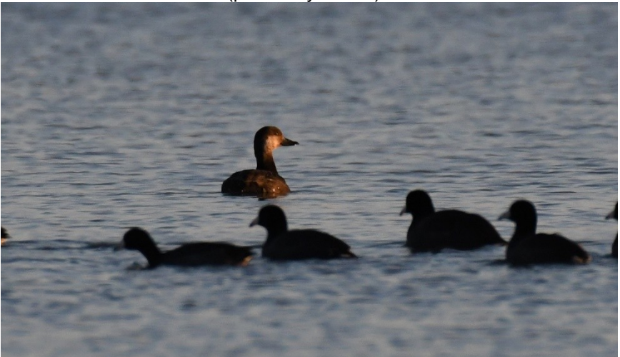
Black Scoter, 29 Oct 2020, Lake Bryan, Brazos Co.

Park on Lake Waco 1 Nov.