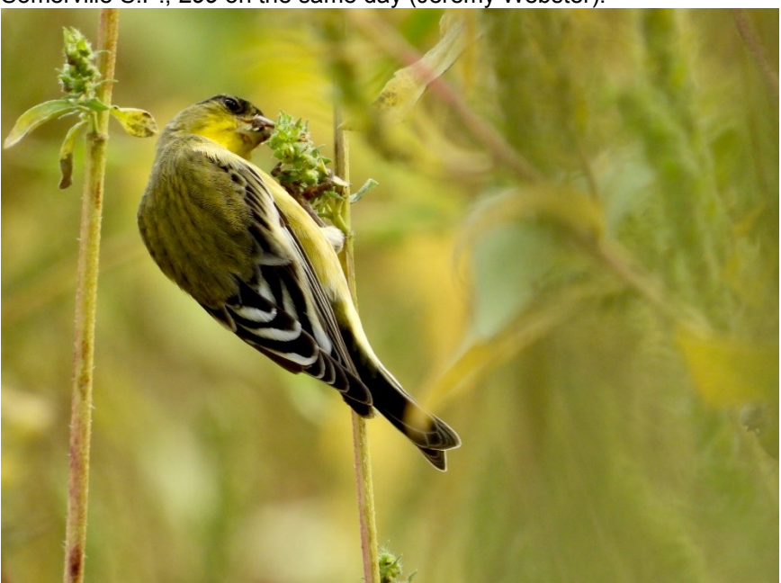
Lesser Goldfinch 6 Nov 2020, College Station, Brazos Co.