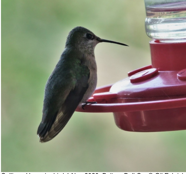
Calliope Hummingbird 1 Nov 2020, Belton, Bell Co.

Calliope Hummingbird – A first record for Milam , an amazing count of up to 3 Calliope Hummingbirds visited a feeder near Gause 25 Nov+ (Donna Lewis). A fourth record for Bell , a female Calliope was at Belton 1 Nov (ph, Gil Eckrich).