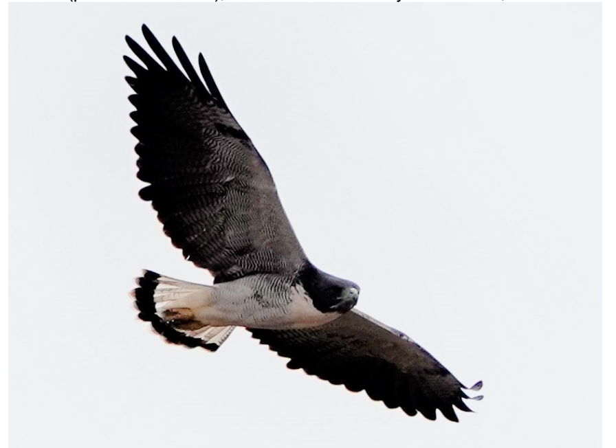
White-tailed Hawk 17 Oct 2020, Sims Lane, Brazos Co.