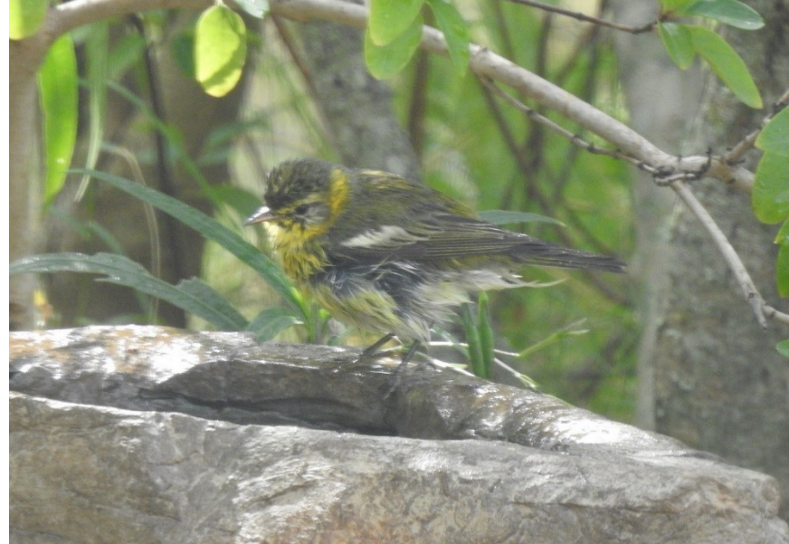
Cape May Warbler 6 Nov 2020, Colovista area, Bastrop Co. © Kathryn McAleese

photographed at a birdbath in the Colovista area 6 Nov (ph. Kathryn McAleese).