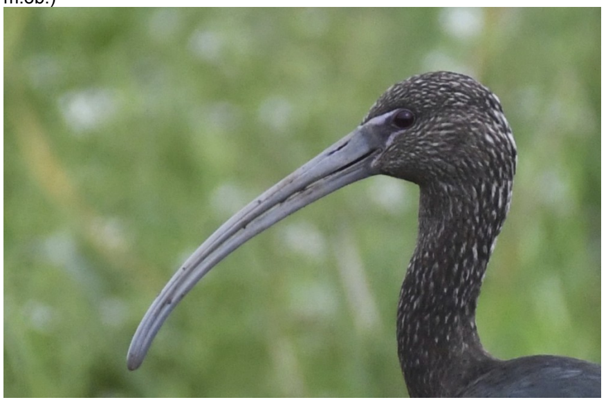
Glossy Ibis 5 Sep 2020, Sims Lane turf farms, Brazos Co.