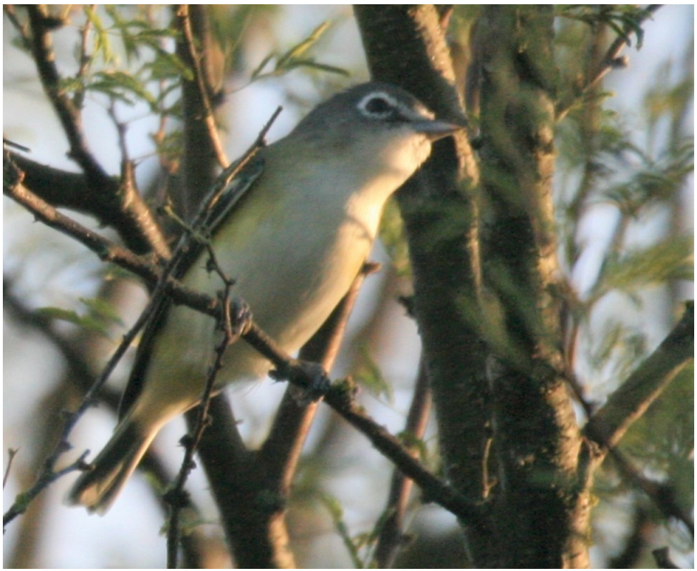
Cassin's Vireo 1 Nov 2020, Bryan City Cemetery, Brazos Co.

Red-breasted Nuthatch – It was a good fall season for Red-breasted Nuthatches in the central oaks and prairies region, with multiple reports 19 Sep+ in Austin, Bastrop Bell, Brazos, Fayette, Grimes, Lee, McLennan, Navarro, Travis, Waller , and Williamson .