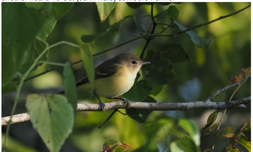
Bell's Vireo 2 Oct 2020, Emerald Forest, Brazos Co.