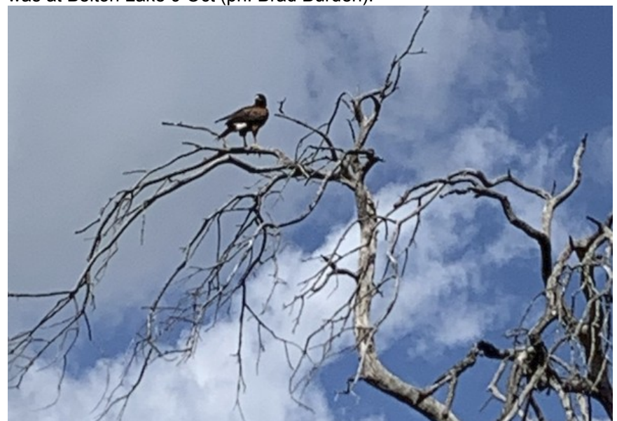
Harris's Hawk 9 Oct 2020, Belton Lake, Bell Co.