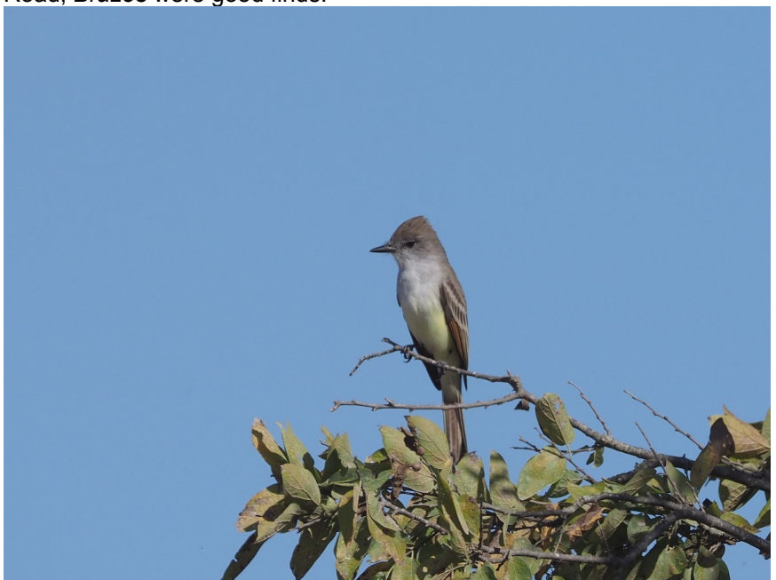
Ash-throated Flycatcher 21 Nov 2020, Sims Lane, Brazos Co.