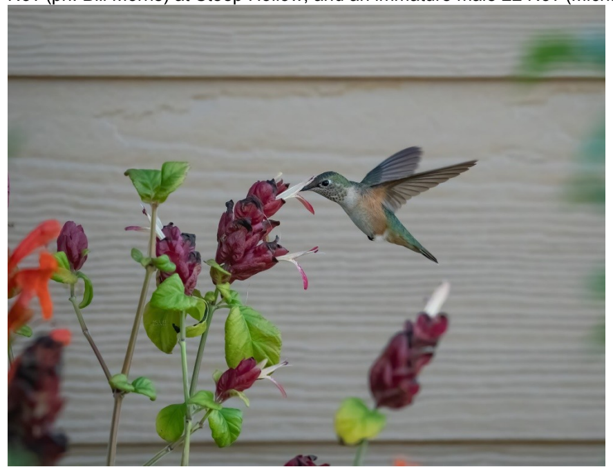
Broad-tailed Hummingbird 21 Oct 2020, Steep Hollow, Brazos Co.