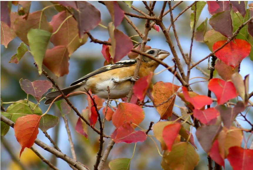
Black-headed Grosbeak 21 Nov 2020, Spring Creek Greenbelt, Brazos Co.