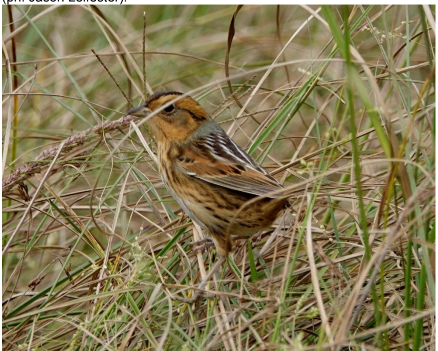
Nelson's Sparrow 17 Oct 2020, Veterans Park, College Station, Brazos Co.

Savannah Sparrow – An estimate of 600 Savannah Sparrows were at Moore Farms, Brazos, after flushing out flocks of 60-100 from dense short roadside vegetation at six locations 30 Oct (John Hale). The count exceeds all historic counts for the Central Brazos Valley and the Central Prairie.