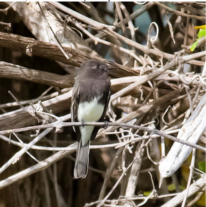
Black Phoebe 10 Nov 2020, Lake Waco, McLennan Co.

Black Phoebe – Two Black Phoebes at Reynolds Creek Park, Lake Waco 10-11 Nov (ph. Jeremy Ballard, Nathan Cowan) is only the second record for McLennan , the first way back in 1975.