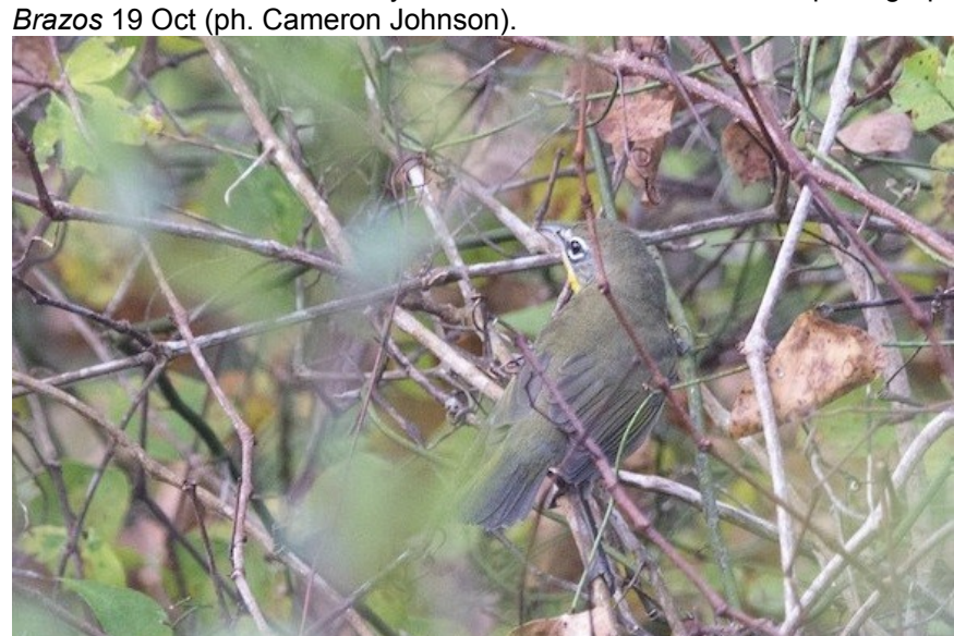
Yellow-breasted Chat 19 Oct 2020, Bryan, Brazos Co.

Yellow-breasted Chat – A very late Yellow-breasted Chat was photographed at Atlas Pear Trails, Bryan,