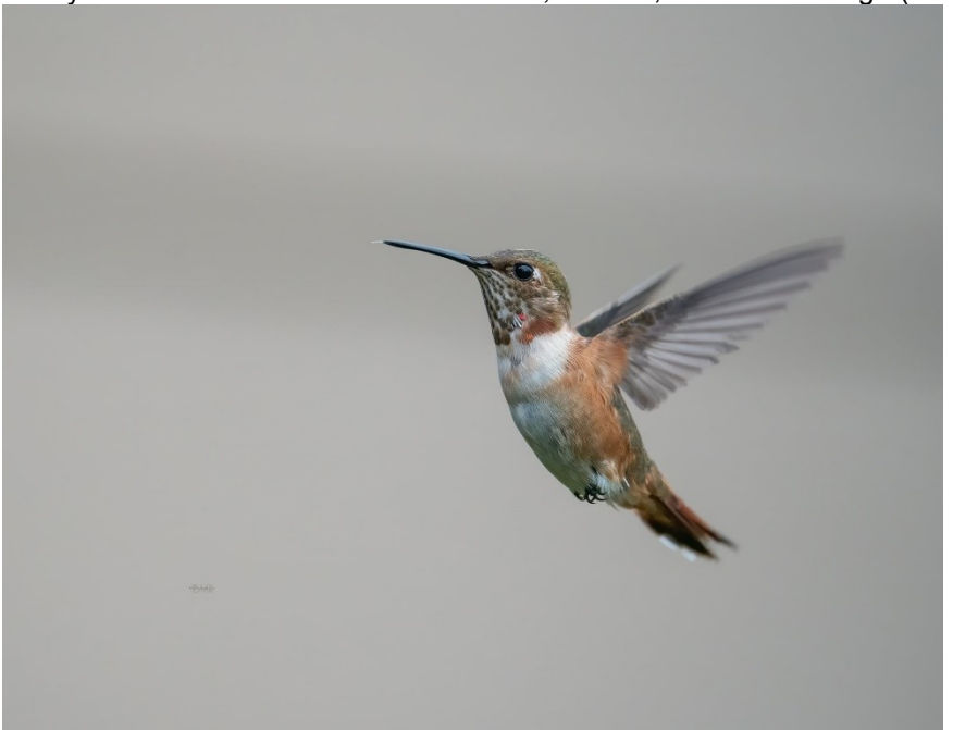
Rufous Hummingbird 21 Oct 2020, Steep Hollow, Brazos Co.

Rufous Hummingbird – An enormous influx of Rufous Hummingbirds descended in the Central Brazos Valley at more than 14 locations in Brazos , Grimes , and Lee 10 Aug+ (m.ob.).