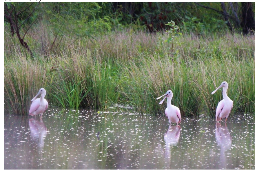
Roseate Spoonbill 1 Aug 2020 Moore Farms, Brazos

Roseate Spoonbill – A new high count for Brazos was 16 Roseate Spoonbills at Moore Farms 1 Aug.