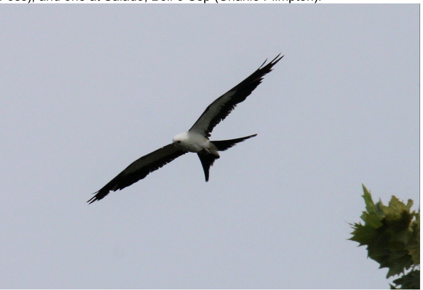
Swallow-tailed Kite 22 Aug 2020, Hwy 6, Grimes Co.

Foss), and one at Salado, Bell 9 Sep (Charlie Plimpton).