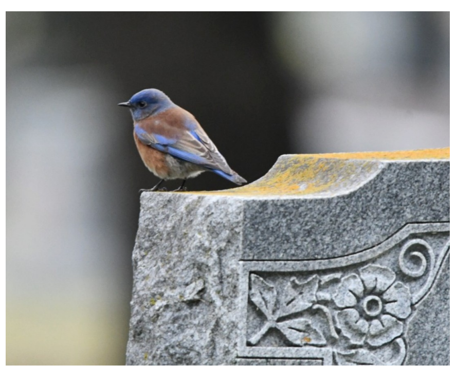
Western Bluebird 28 Nov 2020, Bryan City Cemetery, Brazos Co.