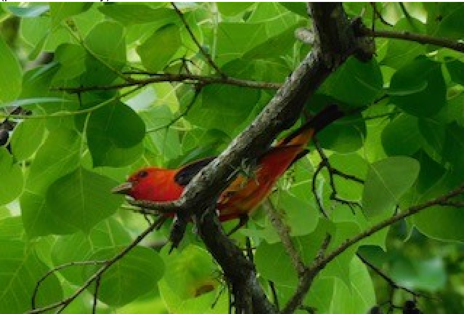
Scarlet Tanager, 3 May 2020, Brazos County

Scarlet Tanager – An excellent find for Brazos, a young male Scarlet Tanager was at Brison park 3 May.