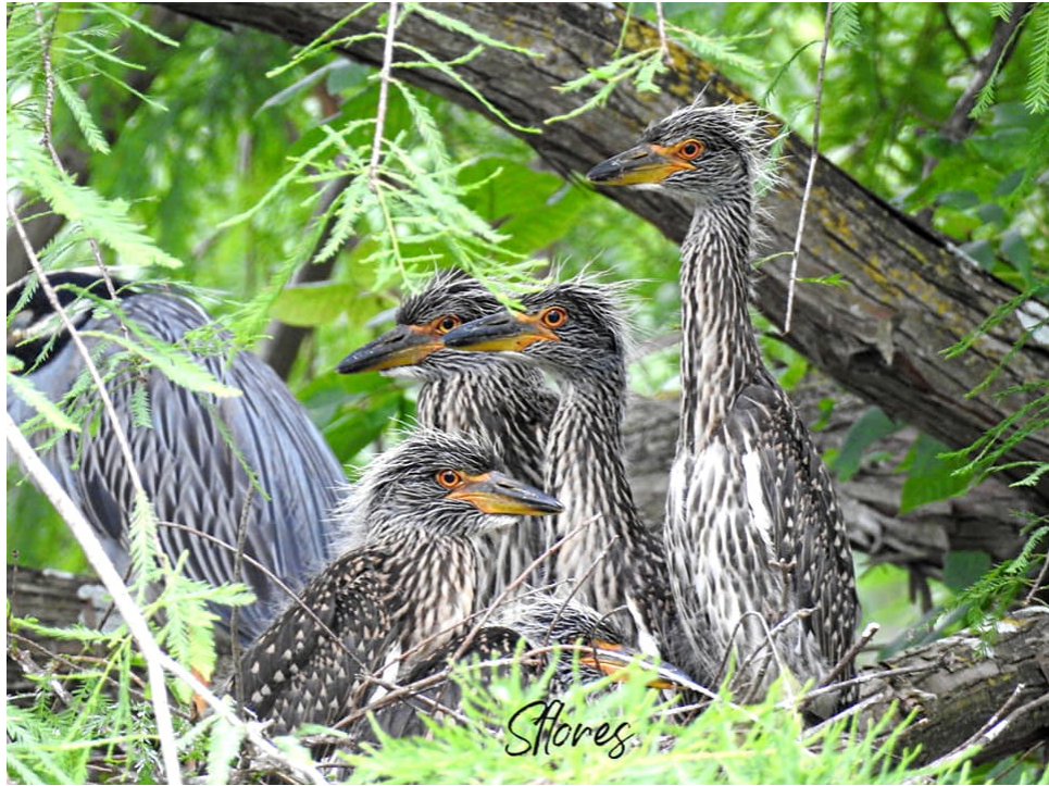
Yellow-crowned Night-Heron, © Smily Flores, 26 May 2020, Brazos County

White Ibis – A dozen White Ibis 16 Apr (†Kelly Sampeck) near Navasota provided only the 3<sup>rd</sup> spring record for Grimes .