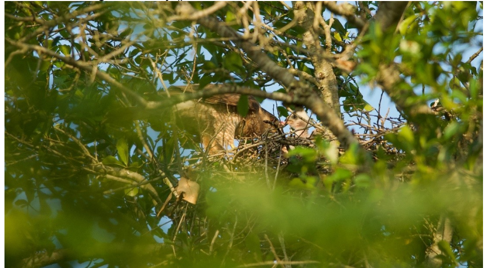
Cooper's Hawk, 22 May 2020, Brazos County

Cooper's Hawk – A pair of Cooper's Hawks again nested at Wolf Creek Park, Brazos. An adult brought food to a nestling 20-22 May.