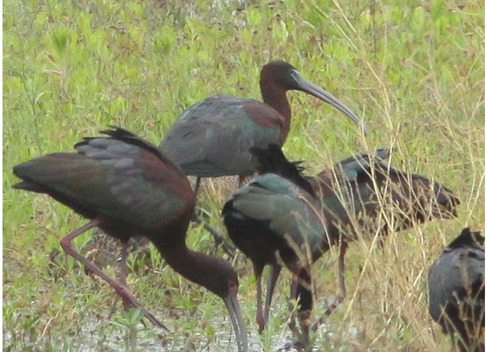
Glossy Ibis, 28 Apr 2020, Bell County