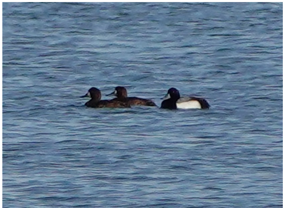
Greater Scaup, 28 May 2020, Brazos County