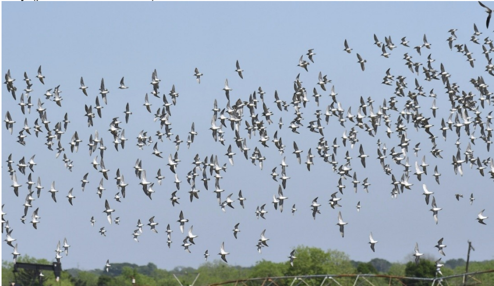
Pectoral Sandpipers in mixed flock, © Simon Kiacz, 25 Mar 2020, Brazos County

Pectoral Sandpiper – Pectoral Sandpipers visited Sims Lane, Brazos 5 Mar–18 May (m.ob.), including a high count of 1100-1200 on 25 Mar–5 Apr (ph. Simon Kiacz, Michael McCloy). A high count for Bastrop at Old Potato Road was one flock of at least 100 with more too far out on the turf farms to identify on 13 May (ph. Jason Leifester).