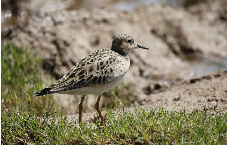
Buff-breasted Sandpiper, © Bryce Loschen, 19 Apr 2020, Brazos County

Buff-breasted Sandpiper – A single Buff-breasted Sandpiper 20 Mar (ph. †Simon Kiacz) was early at Sims Lane, Brazos , and continued to be seen regularly to 26 May. Three seen near Elm Mott 21 May (ph. †Matthew York) are rare migrants through McLennan .