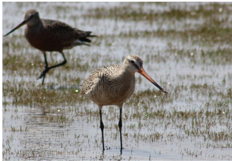
Marbled Godwit, 17 May 2020, Brazos County