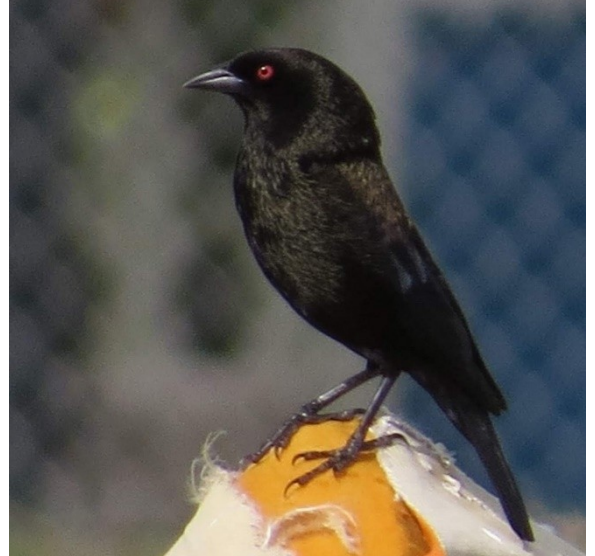
Bronzed Cowbird, 23 May 2020, Bastrop County