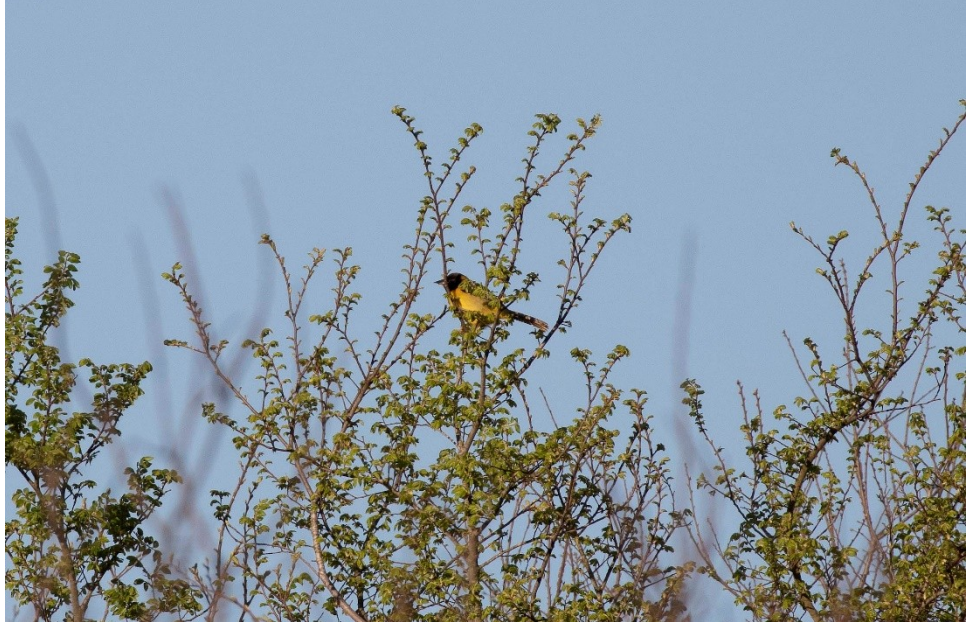
Audubon's Oriole, 5 Mar 2020, Bastrop County