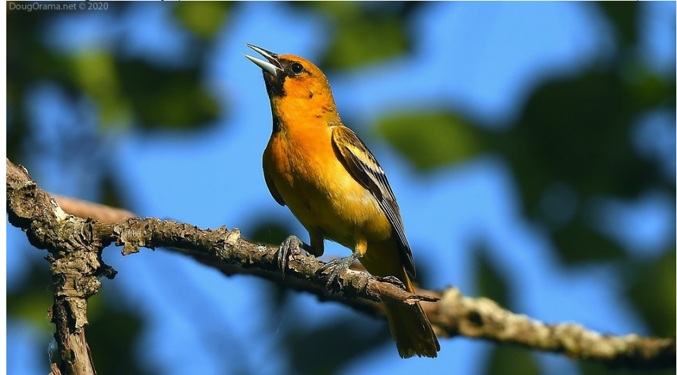
Bullock's Oriole, 3 May 2020, Bell County