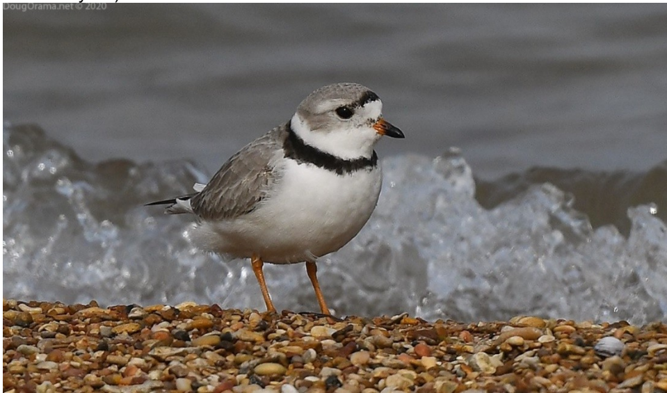
Piping Plover, 25 Apr 2020, Bell County