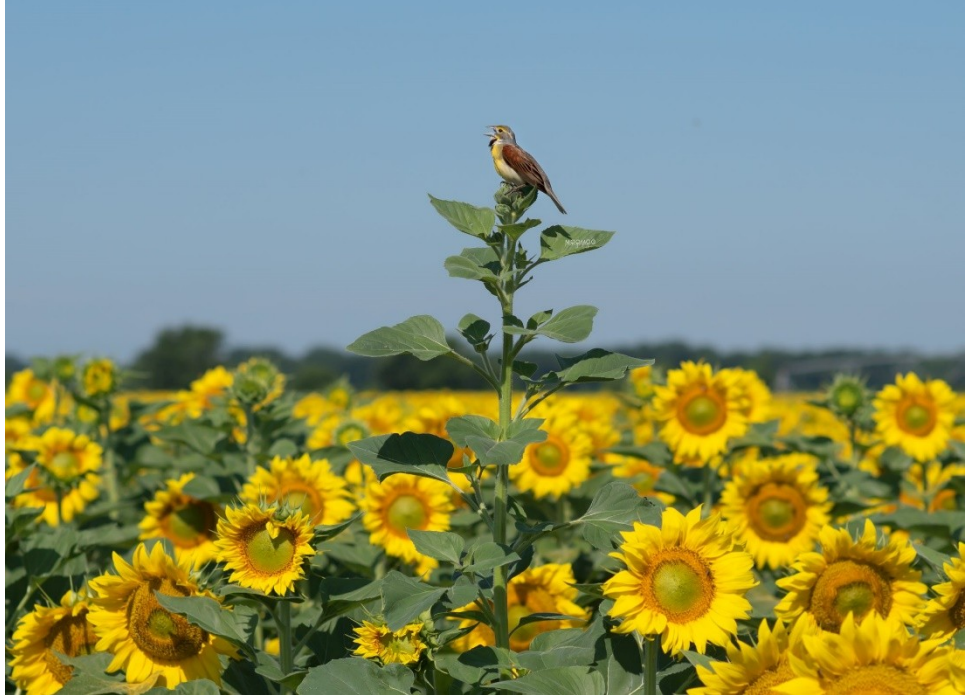
Dickcissel, 27 May 2020, Brazos County