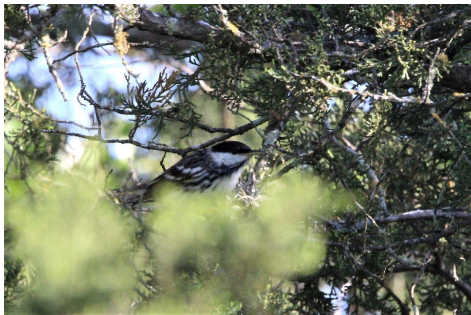
Blackpoll Warbler, © John Hale, 10 May 2020, Brazos County