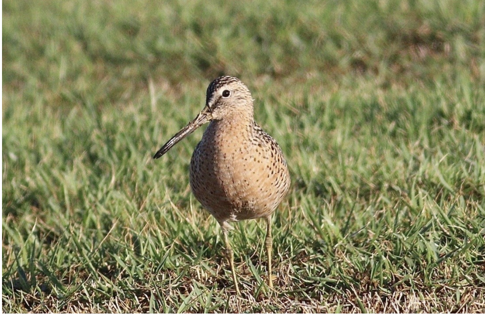
Short-billed Dowitcher, 17 May 2020, Brazos County