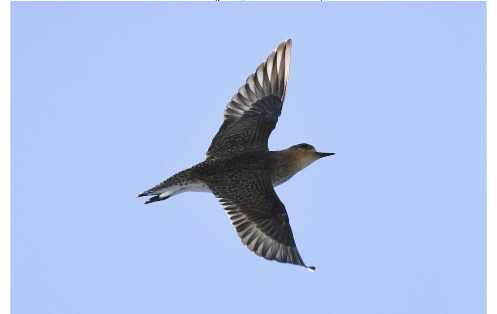
American Golden-Plover, 25 Mar 2020, Brazos County

American Golden-Plover – More than two dozen reports of American Golden-Plover spanned 5 Mar–17 May (m.ob.) in Brazos. Counts were often in the high hundreds, topped by an astounding 2500 covering the sod farm at Sims Lane 25 Mar.