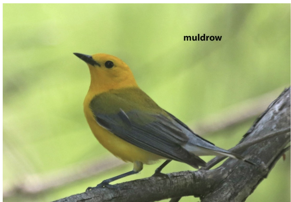
Prothonotary Warbler, 25 Apr 2020, McLennan County