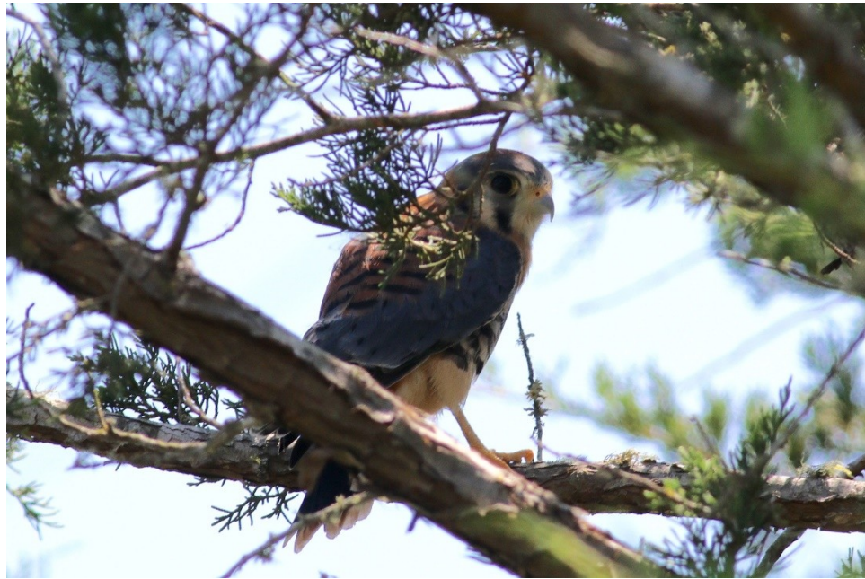
American Kestrel fledgling, 19 May 2020, Brazos County