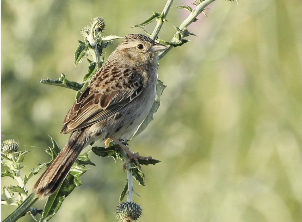
Cassin's Sparrow, © Jason Leifester, 3 May 2020, Bastrop County

Cassin's Sparrow – Occasional in Bastrop , this spring Cassin's Sparrows were reported nearly a dozen times at Gotier Trace Road and Sayersville Road 25 Apr–25 May (ph. Jason Leifester, m.ob.).