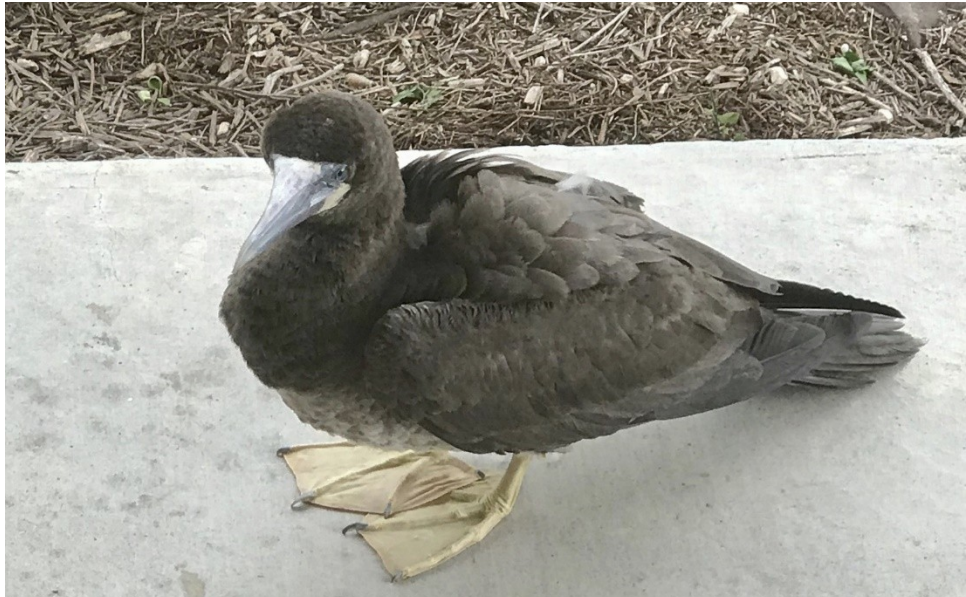
Brown Booby -, 18 Mar 2020, Milam County

Brown Booby – Unbelievably but for photos, an immature Brown Booby was found sleeping on the back porch of a residence in Cameron, Milam 18 Mar. Not surprisingly, it is a first record for Milam.