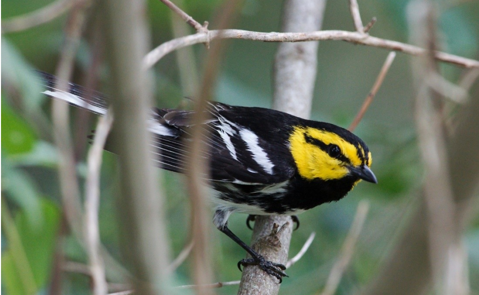
Golden-cheeked Warbler, © Gil Eckrich, 31 May 2020, Bell County

Golden-cheeked Warbler – Not rare in Bell , but the photograph was too good to pass up, taken at Stillhouse Park, Stillhouse Hollow Lake 31 May (ph. Gil Eckrich).