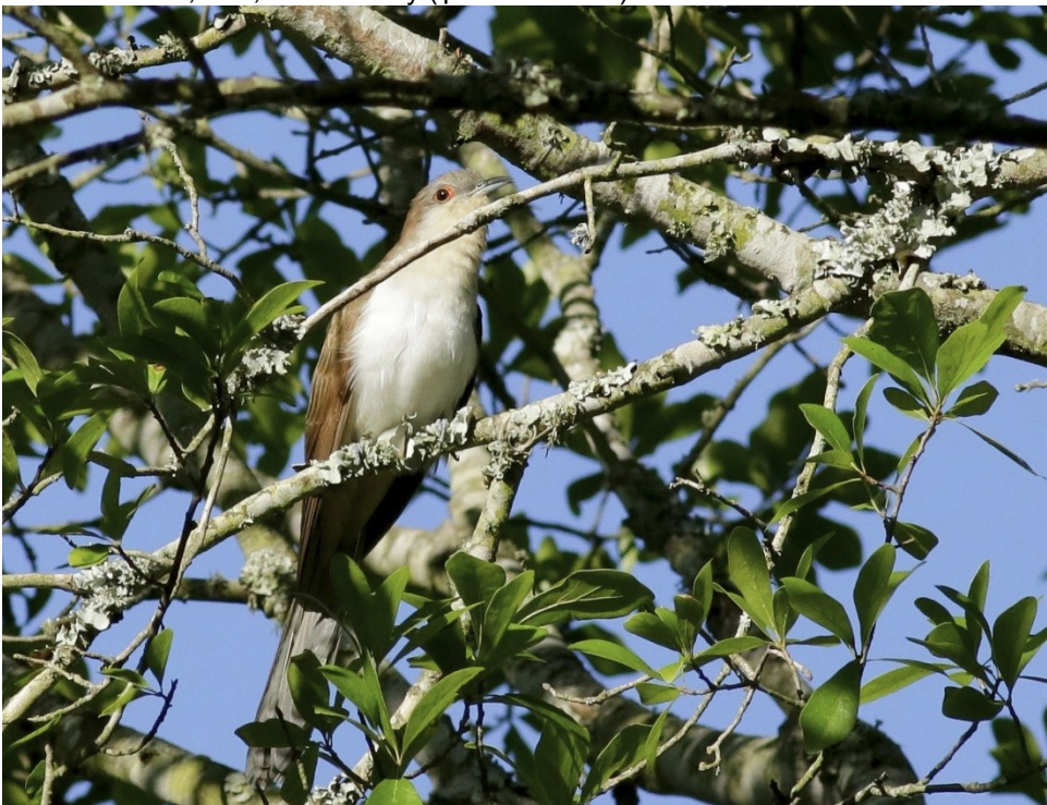
Black-billed Cuckoo, 30 Apr 2020, Brazos County