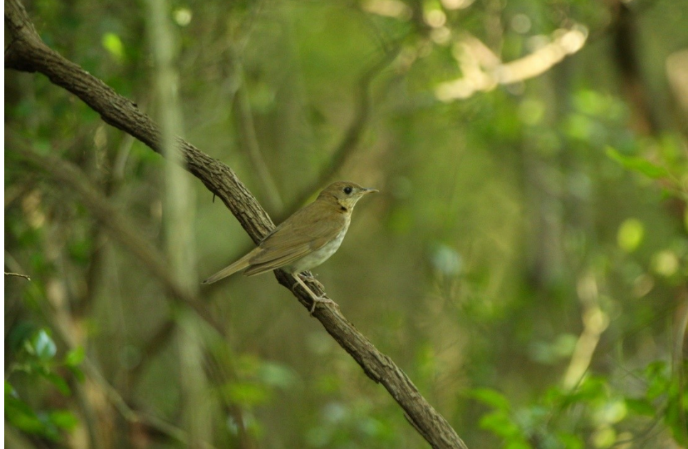
Veery, 11 May 2020, Washington County