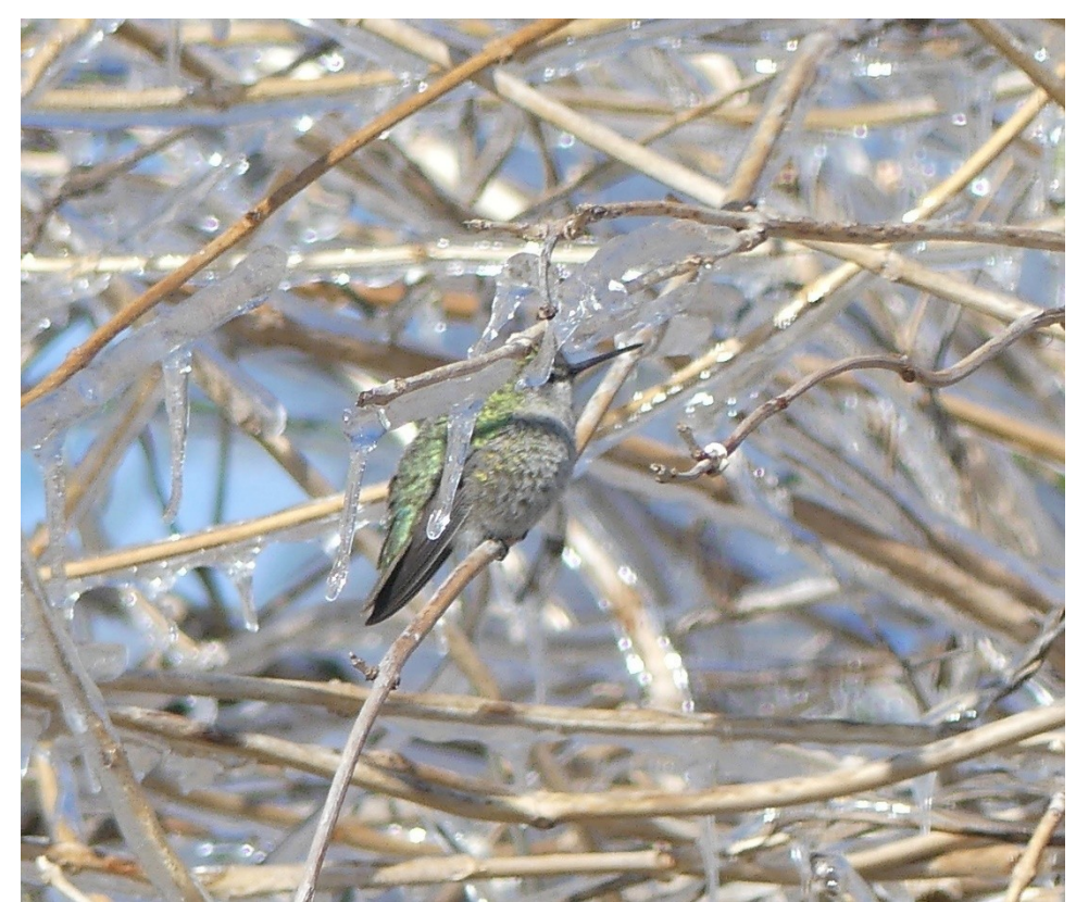
Anna's Hummingbird and icicles, 21 Feb 2021, Bryan, Brazos Co.