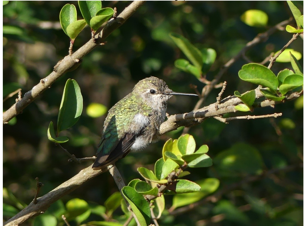
Anna's Hummingbird, 26 Jan 2021, Bryan, Brazos Co.