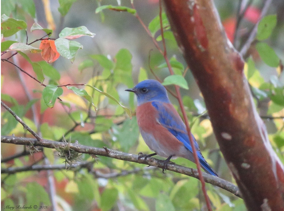
Western Bluebird, 27 Nov 2020, Bryan, Brazos Co.