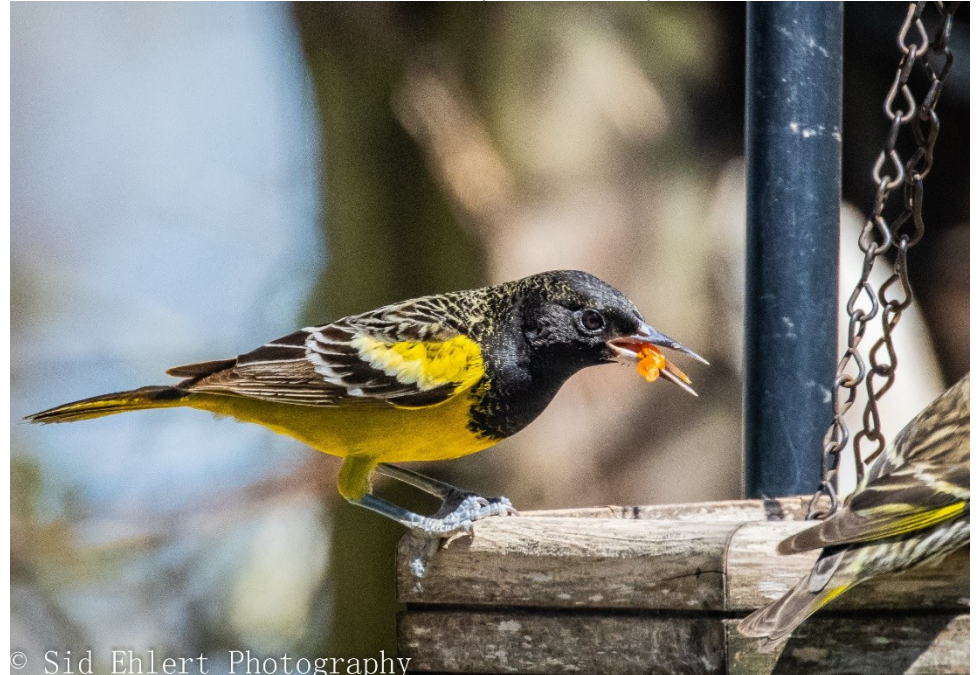
Scott's Oriole, 3 Mar 2021, Grimes Co.