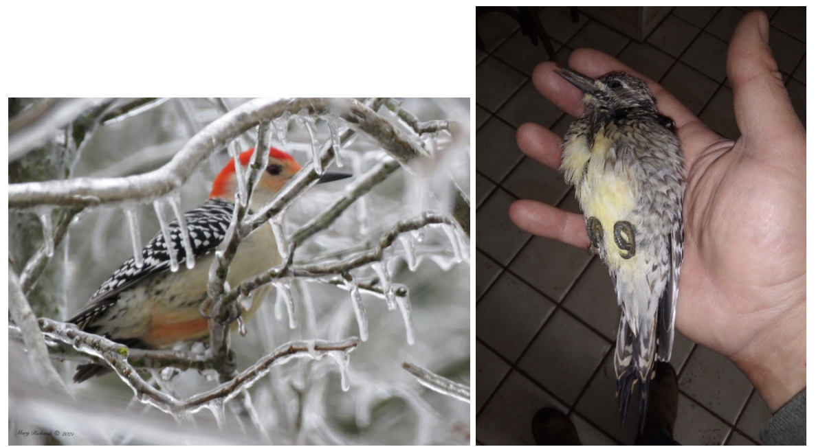
Red-bellied Woodpecker in ice, 18 Feb 2021, Brazos Co., Yellow-bellied Sapsucker fell out of tree and died in his hand, 16 Feb 2021, Brazos Co.