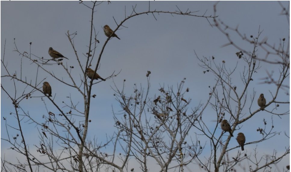
Lark Buntings, 28 Dec 2020, Lee Co.