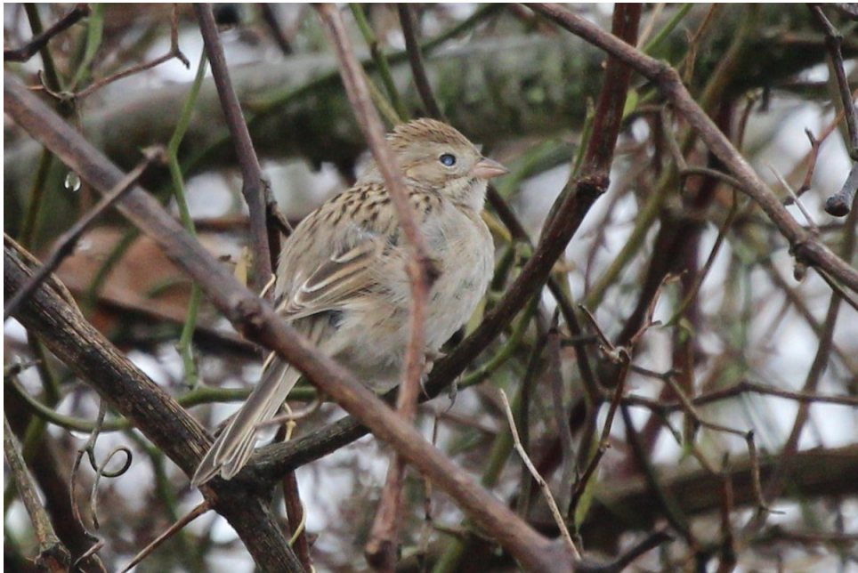
Brewer's Sparrow, 11 Dec 2020, Brazos Co.

Brewer's Sparrow – An unprecedented number of Brewer's Sparrows moved eastward into the central oaks and prairies this winter. Since 1983, there are only seven records for the 21-county region, but this winter produced 19 records in Brazos, Travis, and Williamson counties, plus more sightings in the Edwards Plateau western parts of Bell, Travis, and Williamson counties. Highlighted was a single Brewer's Sparrow at Pitts and Kuder Roads 6 Dec—3 Jan, only the second record for Brazos Co.