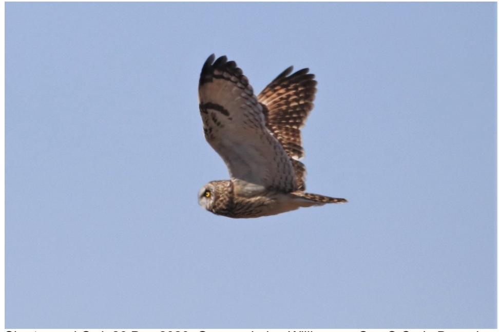
Short-eared Owl, 26 Dec 2020, Granger Lake, Williamson Co., © Craig Browning

Prairie Falcon – A Prairie Falcon at Ship/Stagners Lake 21 Feb (Bernd Gravenstein) is a new location for Bastrop Co., some 20 miles southeast of its occasional appearances at the Old Sayer's Road site.