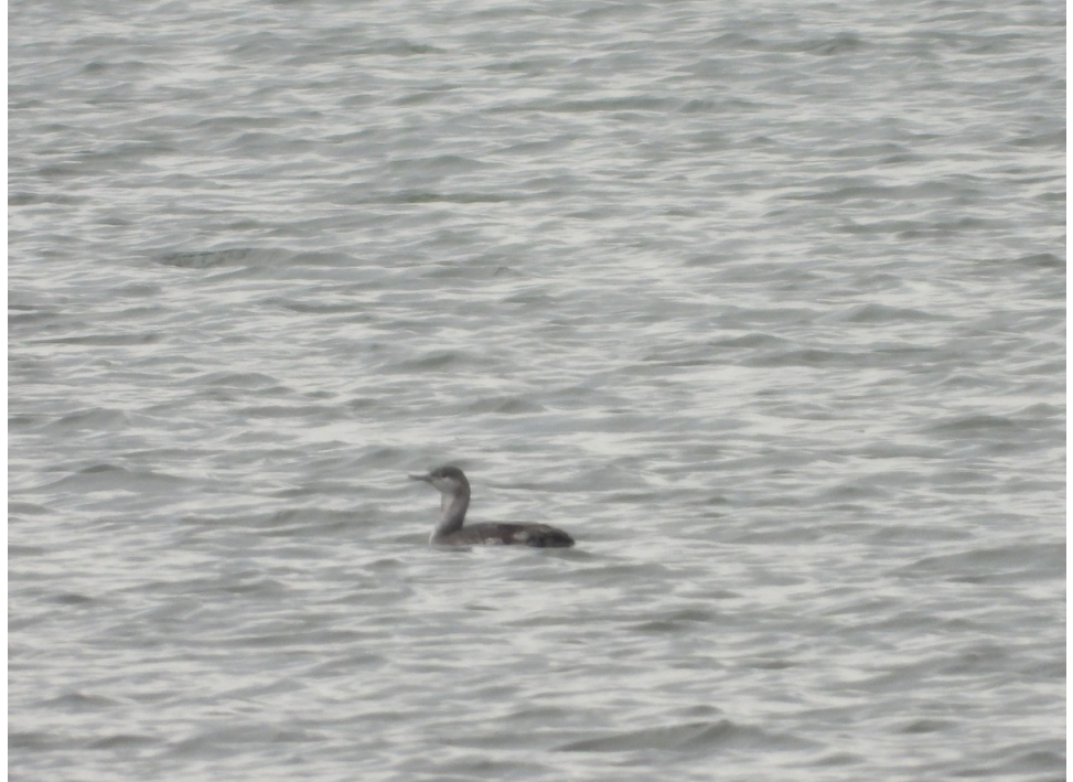
Red-throated Loon, 11 Dec 2020, McLennan Co.