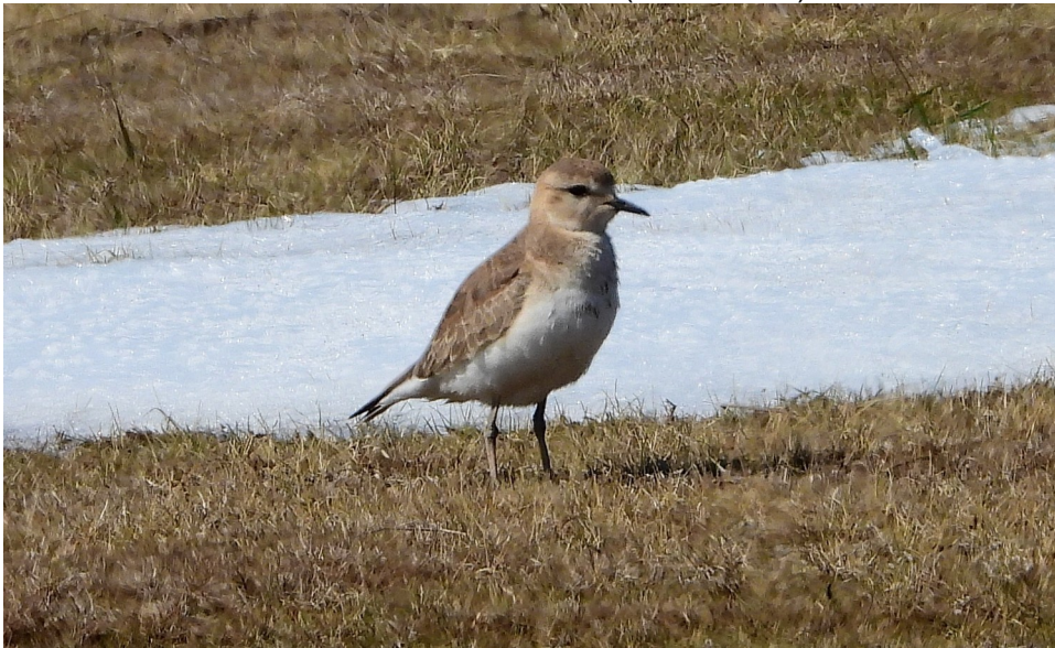
Mountain Plover, 19 Feb 2021, Brazos County