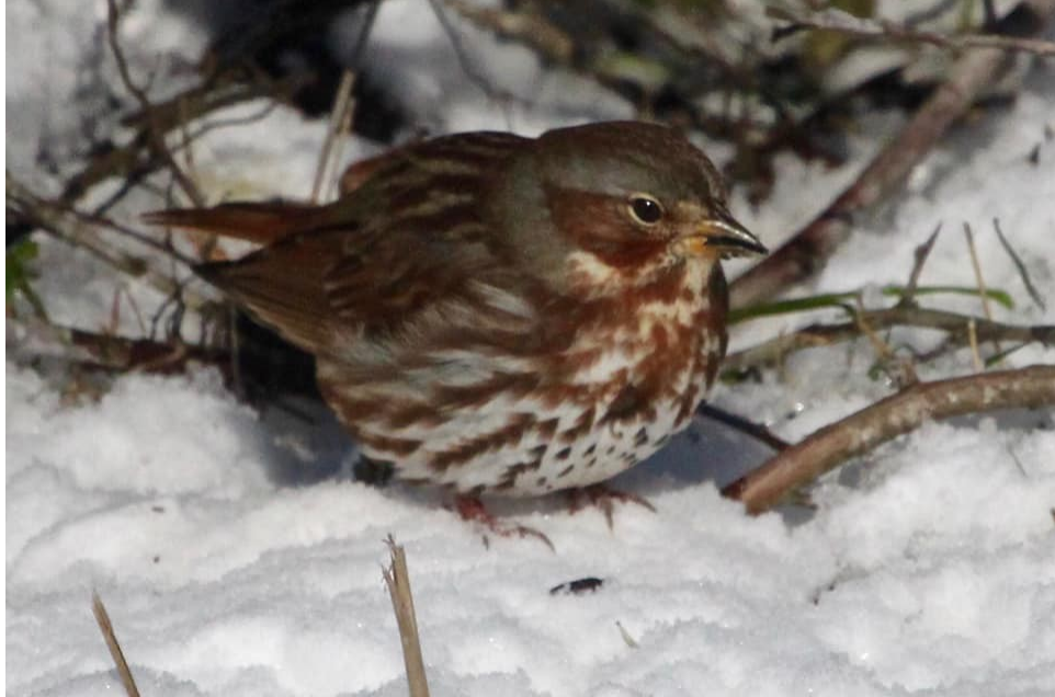
Fox Sparrow in snow, 15 Feb 2021, Brazos Co., © Linda Rothermel