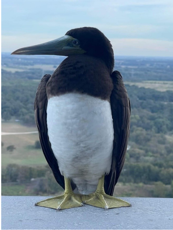
Brown Booby 19 Oct 2021 Sandy Creek Power Plant, McLennan County