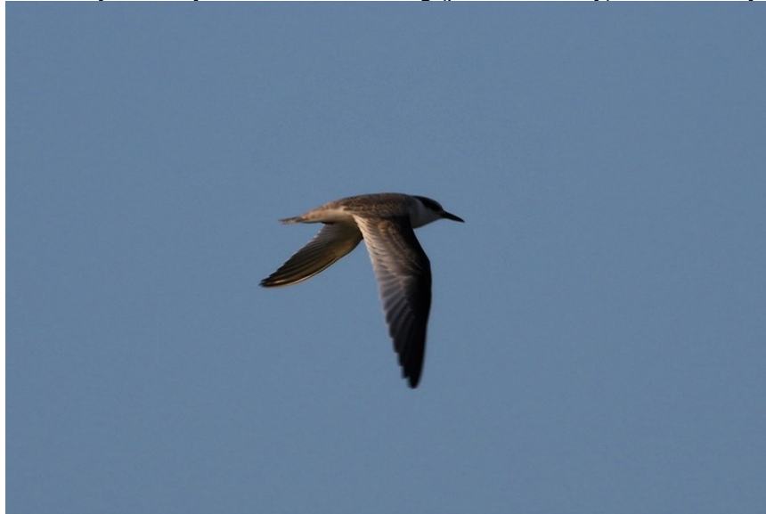
Least Tern 1 Aug 2021 Lake Waco, McLennan County

Least Tern – Least Terns consistently show up at Airport Park on Lake Waco, McLennan Co, although not nearly annually, so three there 1 Aug is noteworthy.