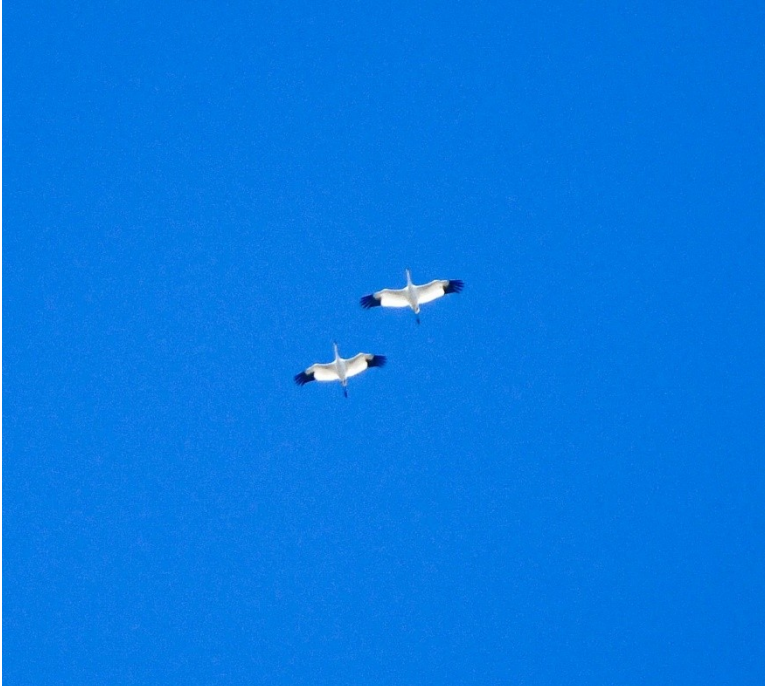
Whooping Crane 12 Nov 2021 Salado, Bell County

Whooping Crane – A pair of Whooping Cranes flew high above Salado, Bell Co 12 Nov (ph. Charlie & Chelsea Plimpton). A few hours later at Stillhouse Hollow Lake, two adults and a juvenile were spotted on an island (ph. Doug Orama). That same afternoon (Phil Rostron) two were seen flying over Bastrop Co with a group of Sandhill Cranes and pelicans. On 16 Nov (Bernd Gravenstein) a single crane flew southeast, with rather fast wingbeats, over Sayers Road, Bastrop Co. In Travis Co three flew south, with slow steady wingbeats, over the toll road near Del Valle 18 Nov (Carlos Ross).