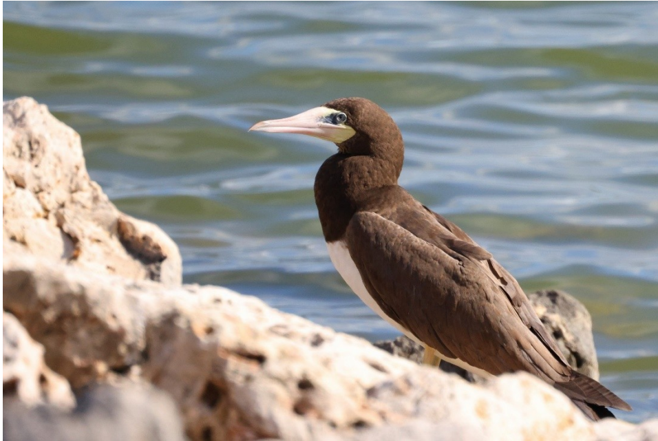
Brown Booby 16 Sep 2021 Lake Bryan, Brazos County