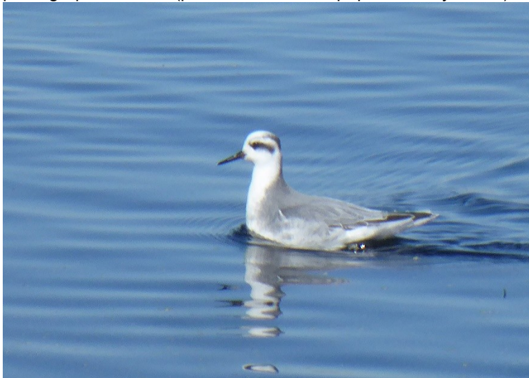
Red Phalarope 5 Nov 2021 Richland Creek WMA, Freestone County