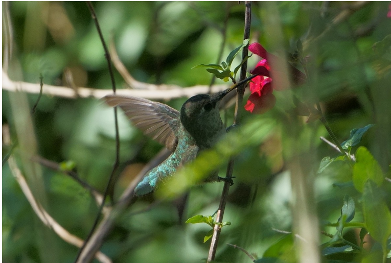
Anna's Hummingbird 6 Nov 2021, Bell County

Anna's Hummingbird – An Anna's Hummingbird was photographed feeding on salvia at a residence near Stillhouse Hollow Lake 6 Nov, a third record for Bell Co.