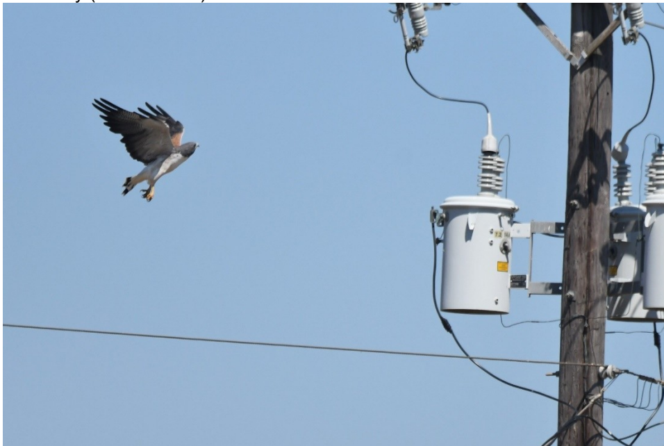
White-tailed Hawk 26 Oct 2021 Sims Lane, Brazos County © Bill Eisele

White-tailed Hawk – Once rare in the Central Brazos Valley, White-tailed Hawks can now be considered occasional. One adult was at Sims Lane at 1:19 PM 26 Sep (ph. Bill Eisele) and probably the same bird was at Sandy Point Road at 3:45 PM (Laura Sare), about two miles away in Brazos Co. Three days later, on 29 Sep (ph. John Pike) and about four miles from the previous sighting, an adult was photographed at Mumford Benchley Road in Robertson Co at 11:03 AM, and the same day at almost the exact same time and eight miles away one was observed overhead in Brazos Co near the Rellis Campus of Texas A&M University (Caleb Evans).