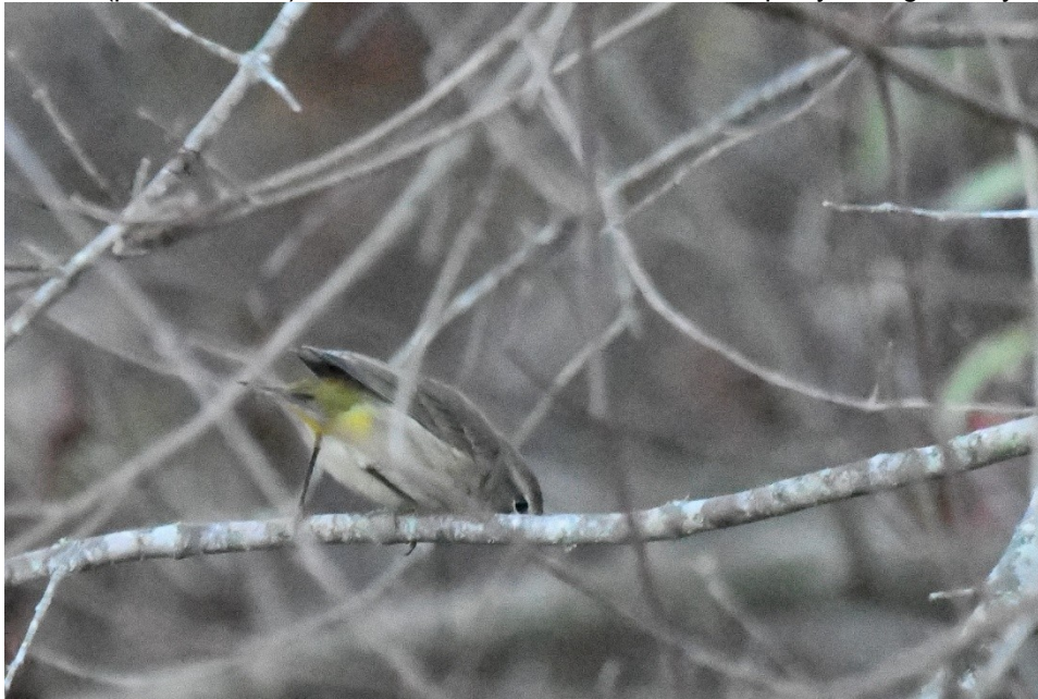
Palm Warbler 17 Nov 2021 Sulphur Springs Road, Brazos County

Palm Warbler – A western Palm Warbler was described and photographed at College Station, Brazos Co 17 Nov (ph. Bill Eisele) where both forms are seen about equally, though rarely.