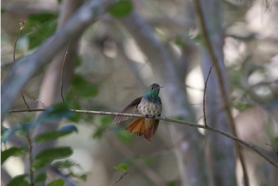
Buff-bellied Hummingbird 21 Sep 2021 Laas Farm, Waller County © Harvey Laas

Buff-bellied Hummingbird – Only the second record for Waller Co, a Buff-bellied Hummingbird was seen and photographed at Laas Farm 21-24 Sep (ph. Harvey Laas).