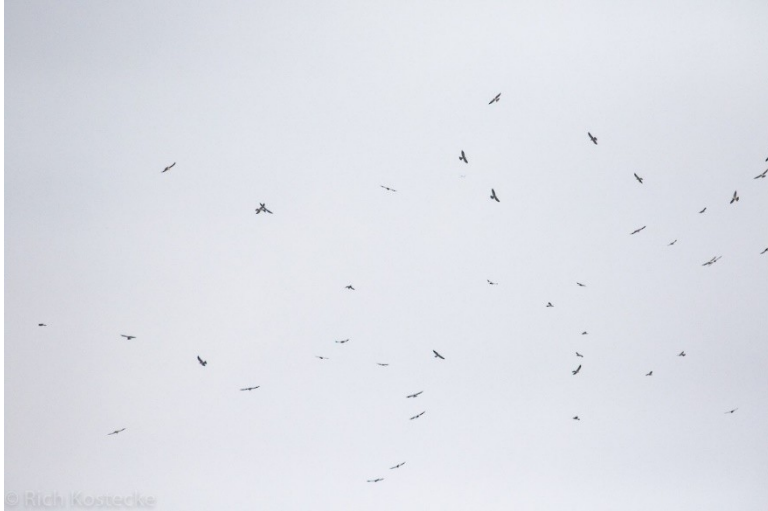
Mississippi Kite 7 Sep 2021 Lake Georgetown, Williamson County