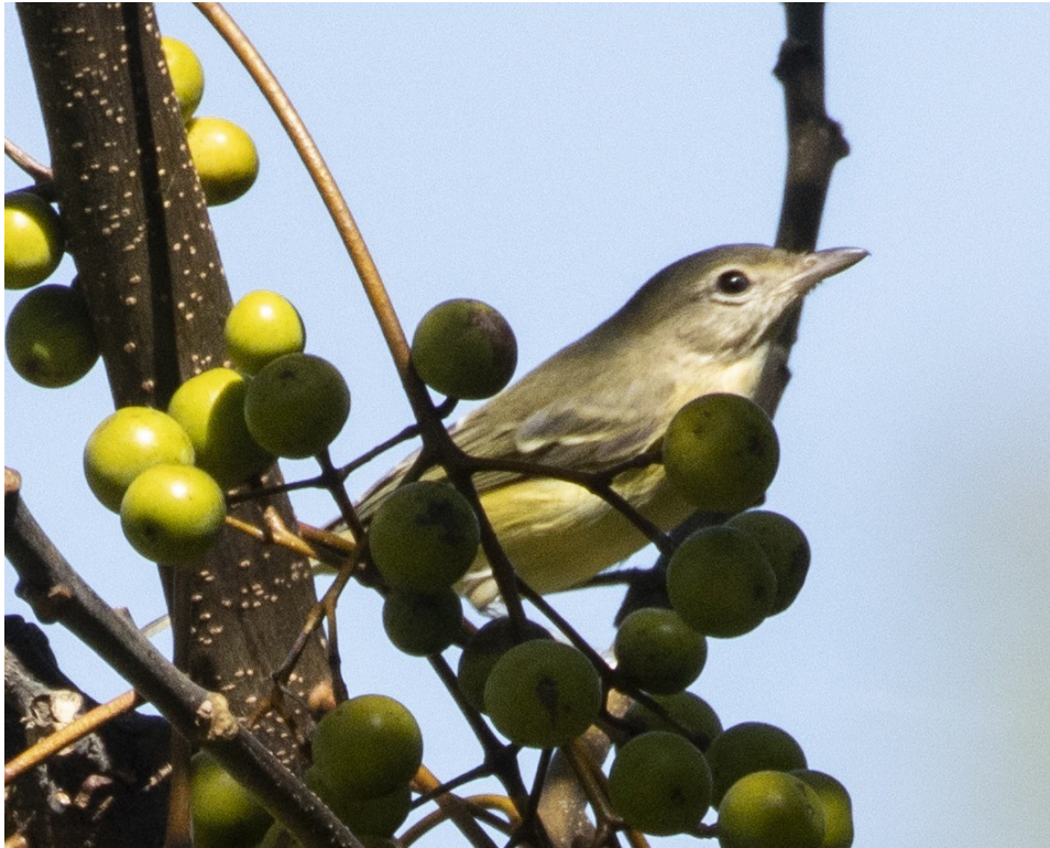
Bell's Vireo 11 Oct 2021 Stillhouse Hollow Lake – Gravel Crossing WMA, Bell County

Bell's Vireo – A late departing Bell's Vireo was photographed 11 Oct 2021 at Stillhouse Hollow Lake, Bell Co.