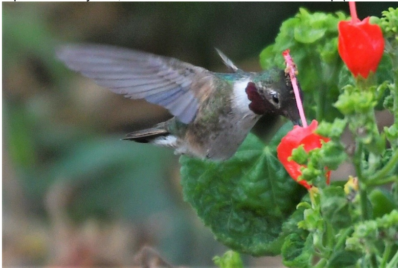
Broad-tailed Hummingbird 9 Sep 2021 Carleen Bright Arboretum, McLennan County