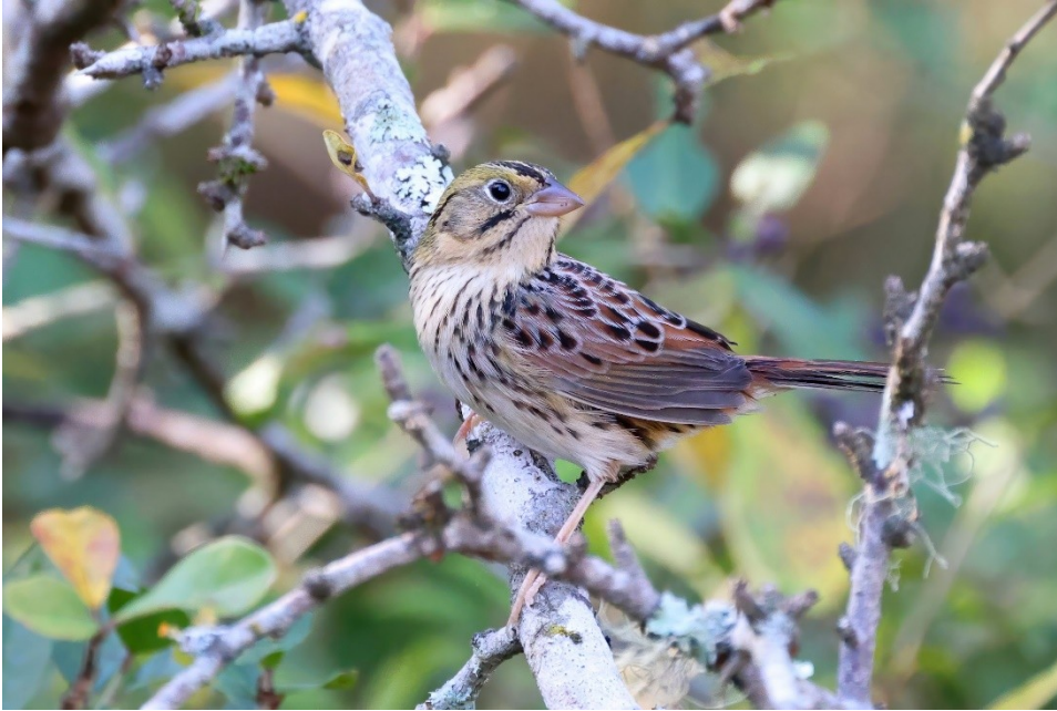
Henslow's Sparrow 14 Nov 2021 Texas A&M University Ecology and Natural Resource, Brazos County

Yellow-breasted Chat – An early migrating Yellow-breasted Chat was at College Station, Brazos Co 14 Aug (Simon Burton).