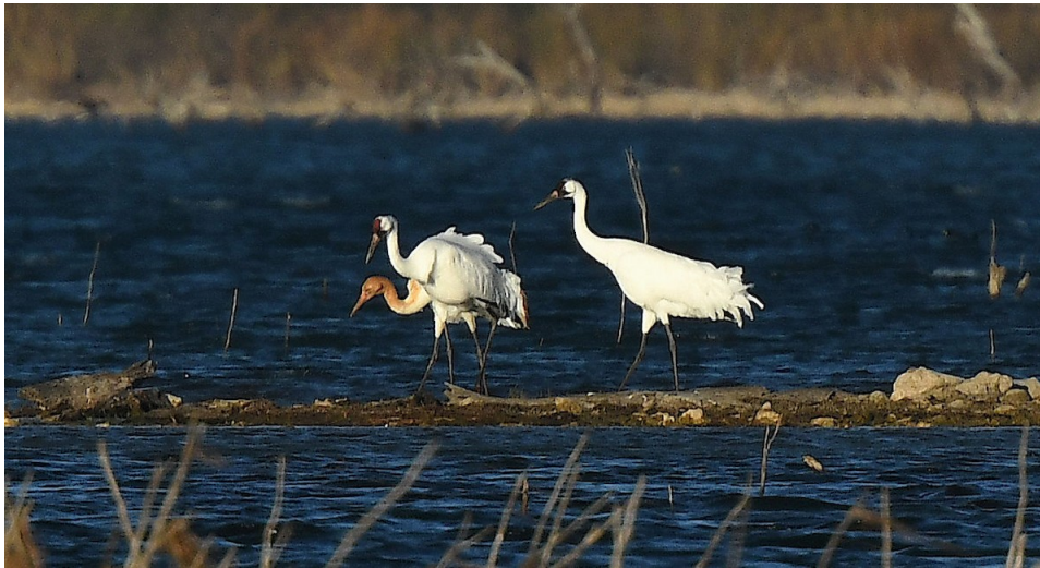
Whooping Crane 12 Nov 2021 Stillhouse Hollow Lake, Bell County © Doug Orama

Black-bellied Plover – With few records in McLennan Co, a Black-bellied Plover at Trading House Creek Reservoir 2 Oct (Greg Cook) is a good find.