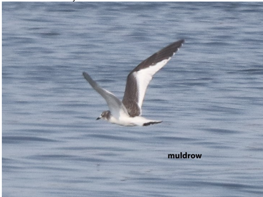
Sabine's Gull 25 Sep 2021 Trading House Creek Reservoir, McLennan County