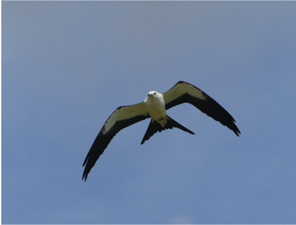
Swallow-tailed Kite 29 Aug 2021 Sayers Road, Bastrop County