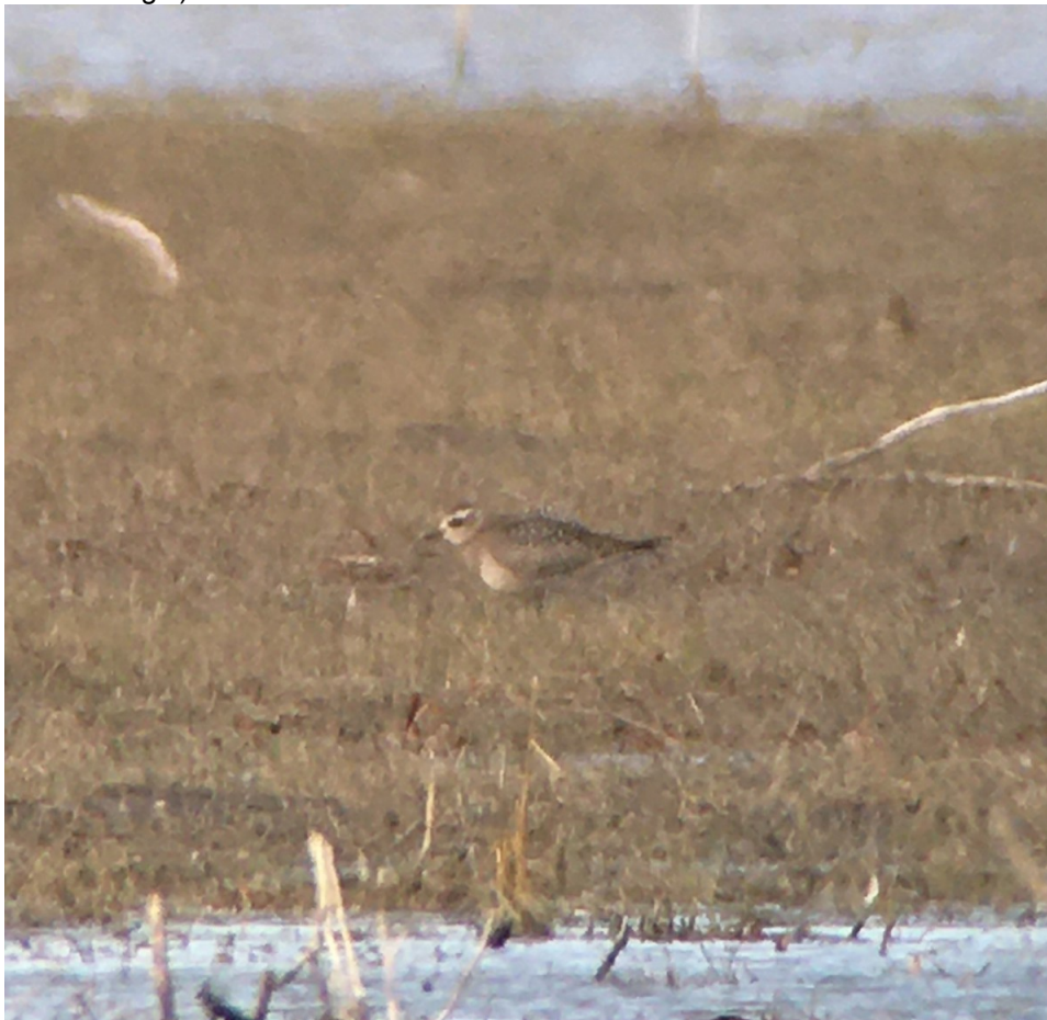
American Golden-Plover 25 Nov 2021 Union Grove WMA, Bell County © Shelia Hargis

American Golden-Plover – A late American Golden-Plover was at Union Grove WMA, Bell Co 25 Nov (ph. Shelia Hargis).