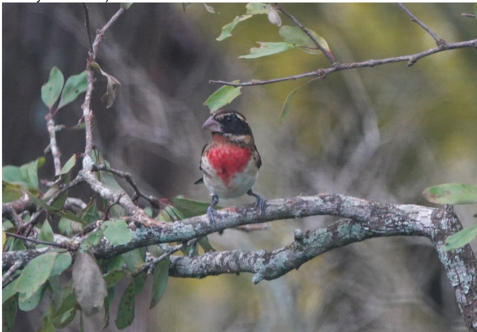
Rose-breasted Grosbeak 26 Oct 2021 Kurten, Brazos County © Shirley Wilkerson

Rose-breasted Grosbeak – A much-photographed grosbeak, that first appeared to be a hybrid, turned out to be an immature male Rose-breasted Grosbeak transitioning to adult plumage 26-30 Oct 2021 (ph. Shirley Wilkerson).