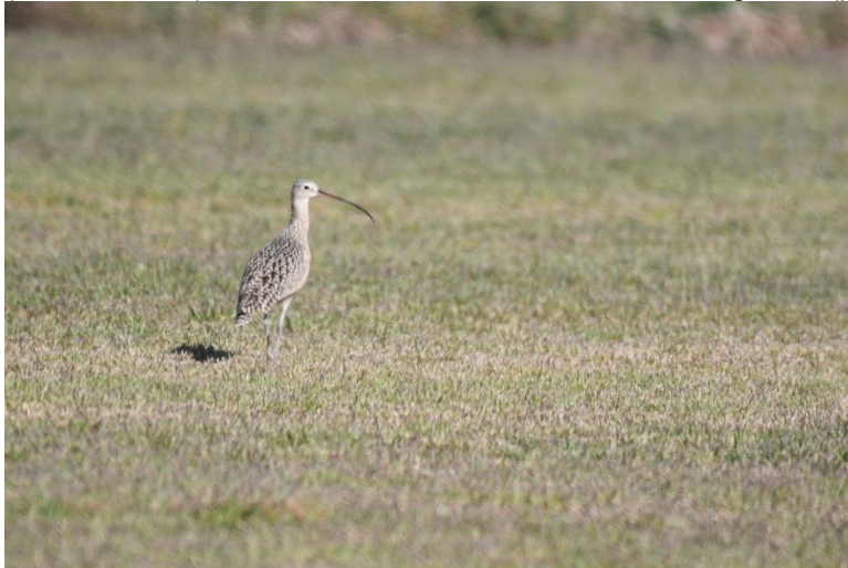
Long-billed Curlew 14 Nov 2021 Sims Lane, Brazos Co

Long-billed Curlew – Sightings in the central oaks and prairies compounded starting in 2000, particularly at turf farms. One to two were present at the Sims Lane turf farm in Brazos Co 29 Oct—19 Nov 2021 (Brandon Woo) and three flew over Moore Farms 28 Aug 2021 (ph. John Hale).