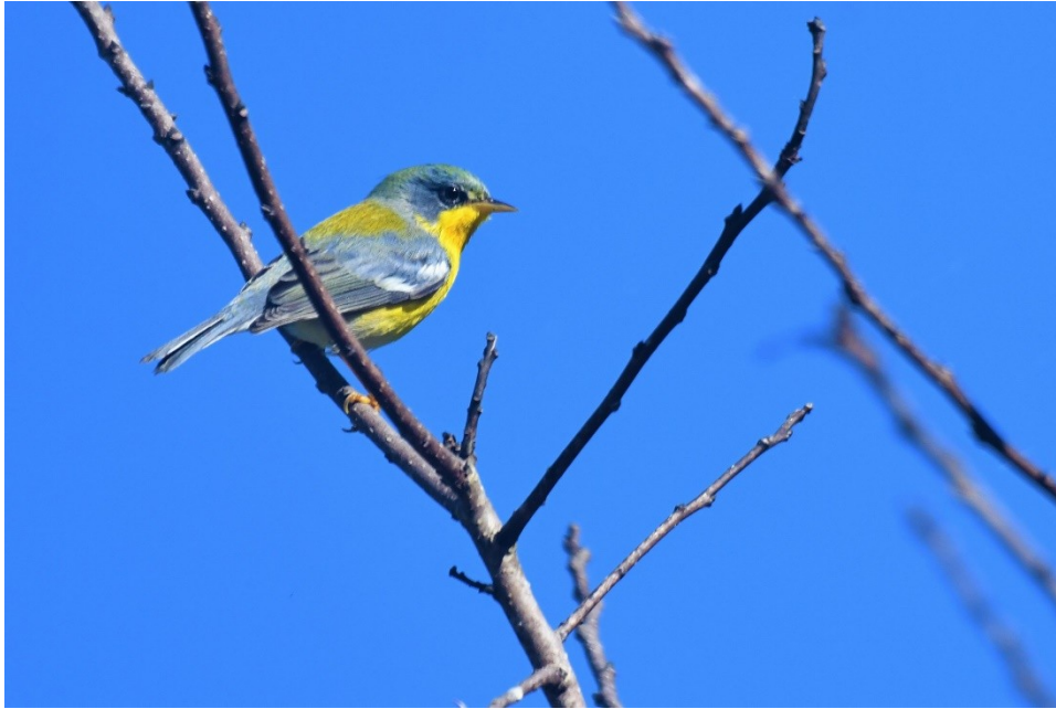
Tropical Parula 24 Sep 2021 Sulphur Springs Road, Brazos County

Chestnut-sided Warbler – Rare in fall, a Chestnut-sided Warbler was among a mixed flock of warblers at Salado, Bell Co 6 Sep (Charlie Plimpton).