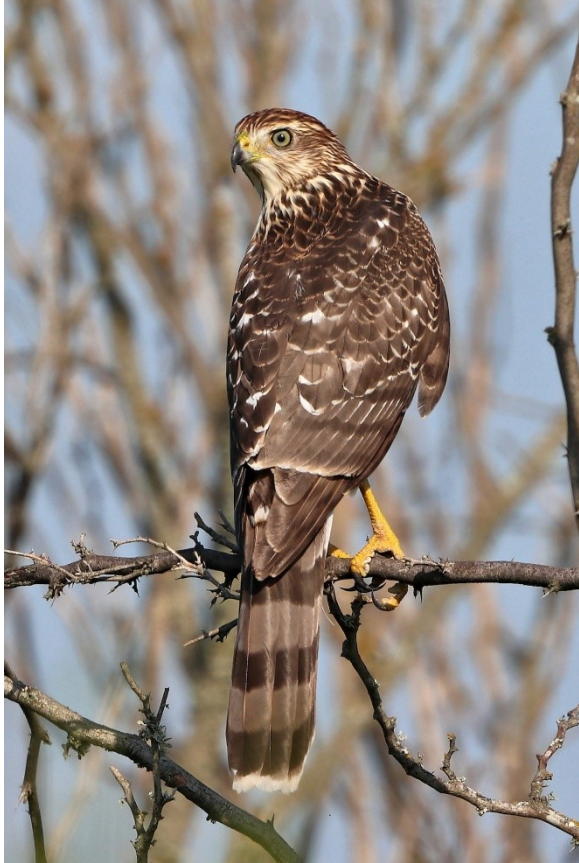
Cooper's Hawk 1 Aug 2021 Elgin River Road, Bastrop County © Jason Leifester

Cooper's Hawk – Three sightings of young Cooper's Hawks are indicative of local breeding, including one at Sayers Road and another at Upper Elgin River Road, both in Bastrop Co 1 Aug (ph. Jason Leifester), and one begging for food from a nearby adult at Brothers Pond Park in Brazos Co 19 Aug (Chris Butler).