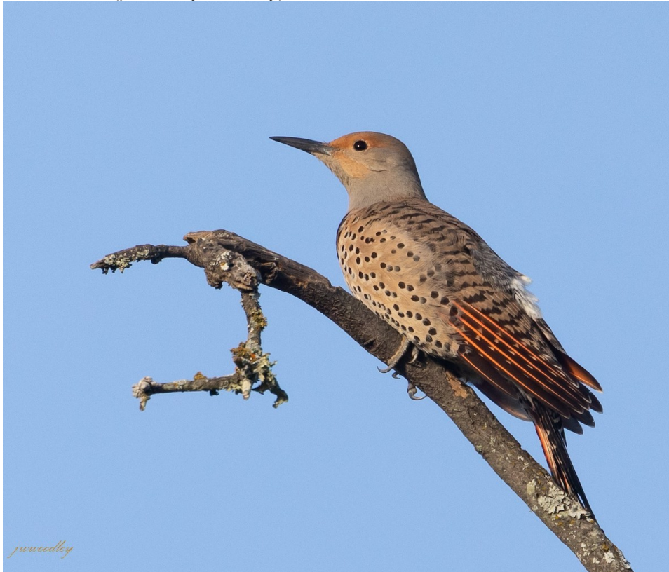
Yellow-shafted x Red-shafted Flicker 17 Nov 2021 Navarro Mills Lake, Navarro County