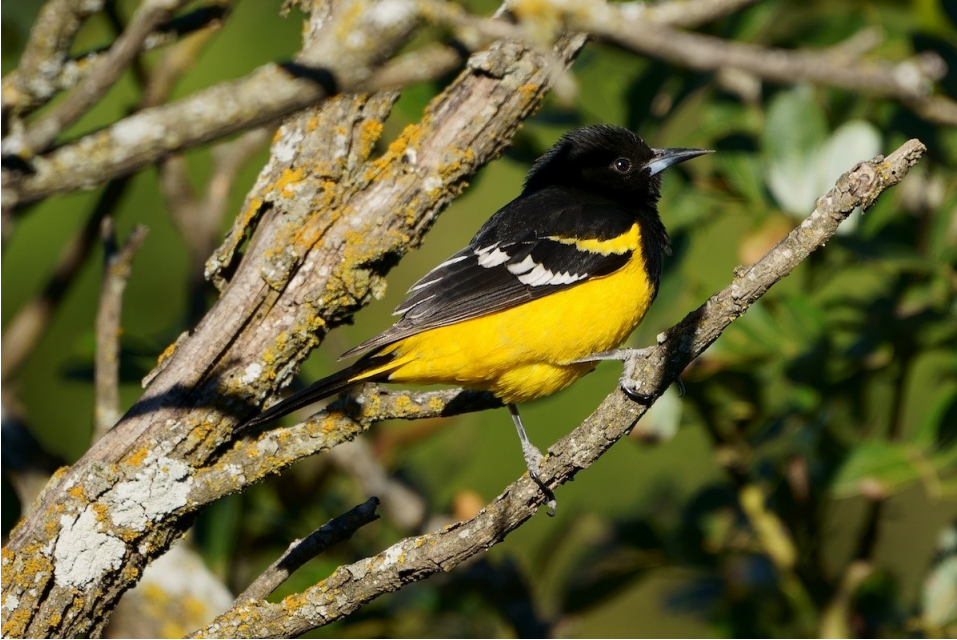
Scott's Oriole, 5 Mar 2021, Bell County