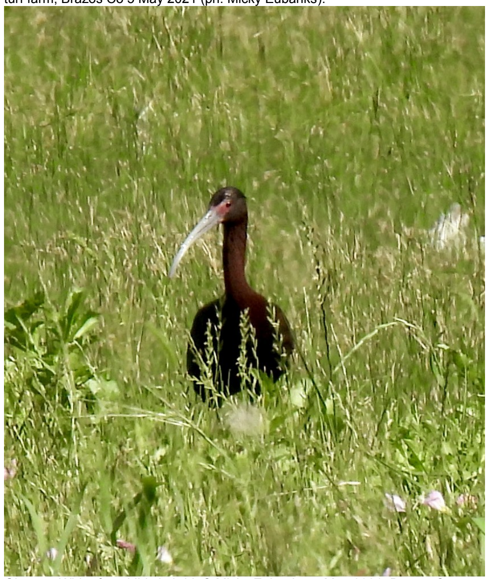
Glossy x White-faced Ibis hybrid, © Micky Eubanks, 5 May 2021, Brazos County

Glossy x White-faced Ibis hybrid – A Glossy x White-faced Ibis hybrid was photographed at Sims Lane turf farm, Brazos Co 5 May 2021 (ph. Micky Eubanks).