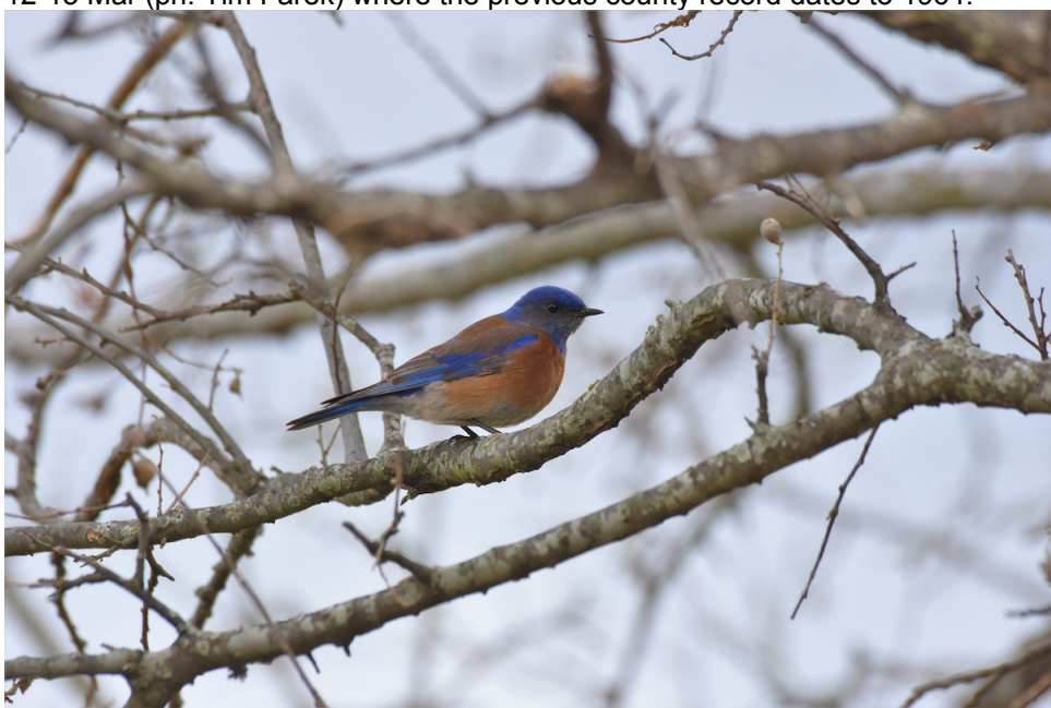
Western Bluebird, 12 Mar 2021, McLennan County

Mountain Bluebird – Five Mountain Bluebirds continued at Valley Mills, McLennan Co until 15 Mar.